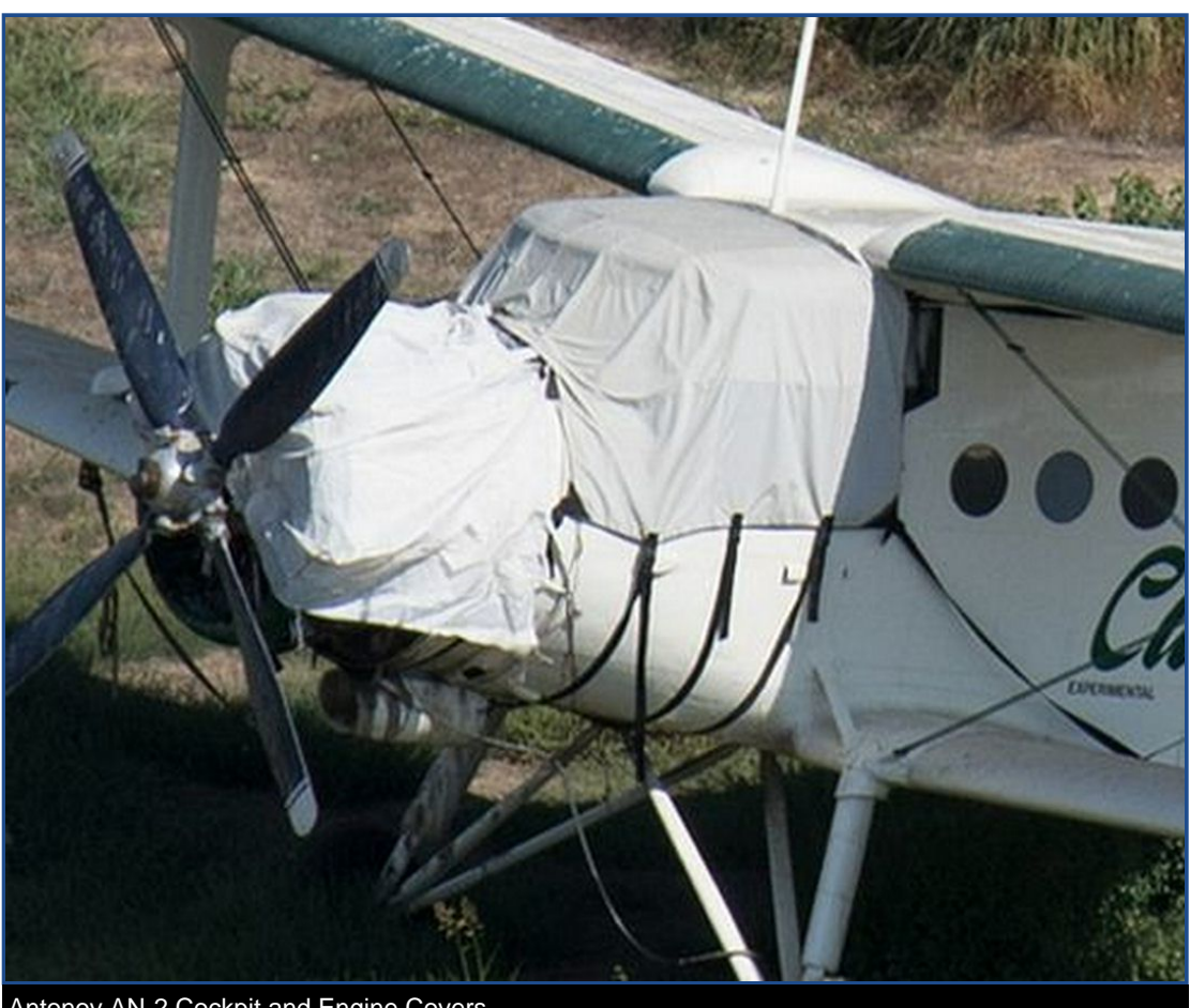
Antonov AN-2 Cockpit and Engine Covers