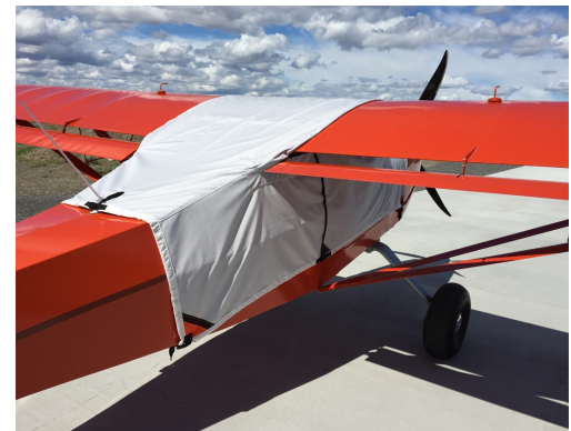
Kitfox IV Over-the-top Canopy Cover