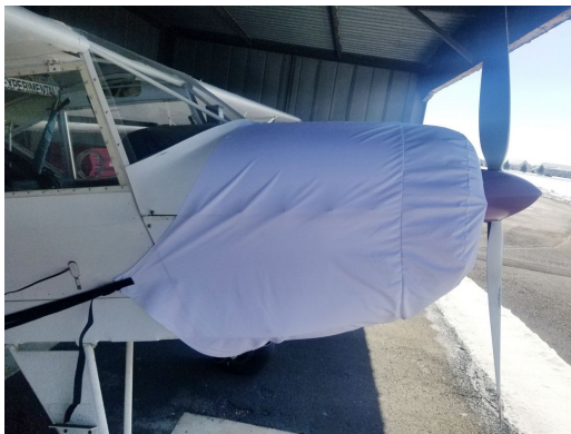
Kitfox Engine Cover, "Radial Cowl" type, test fit

This cover type is made from Silver Acrylic Sunbrella canvas and is 100% lined with a soft and smooth microfiber. Bruce's Custom Covers developed this material combination especially for aircraft protection. The outer material is medium weight and treated for water resistance, UV resistance and anti-static buildup. The inner lining is a very soft and smooth microfiber to prevent scratching. The material is very reflective, and tests show that the cabin interior temperature can be reduced to near-ambient temperature on the hottest of days. It is water, ice and snow repellent, yet breathable to allow moisture to escape from between the cover and the aircraft surface.