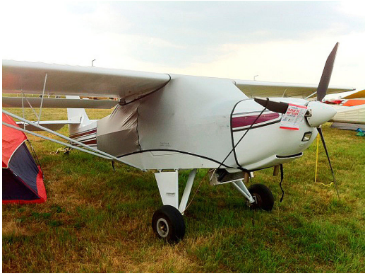
Kitfox Spandex FlyAway Travel Canopy Cover

Travel Covers are made with Silver Solution-Dyed Polyester fabric and only lined over the windshield to save weight. The material is lightweight and more compact for easy stowage in the aircraft. The polyester material is water resistant, but only intended for occasional use outside. We also have an ultra lightweight material available for fitted hangar dust covers. For daily outdoor use, the non-travel Sunbrella Cover is the best choice.