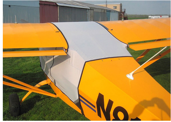
Aerotrek A240 Spandex FlyAway Travel Canopy Cover