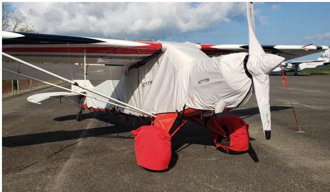
Aviat Husky Extended Canopy Cover, Engine, Prop, Empennage & Tire Covers

ALL-YEAR USE MATERIAL - Made with Silver Acrylic Sunbrella canvas, the all-year use material is the best option for sun protection and cover longevity. This heavier more durable material is intended for all weather conditions, such as rain and snow or lots of sun.