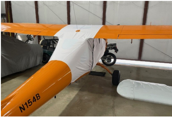
Aeromarine Merlin Over-Top Canopy Cover, test fit cover