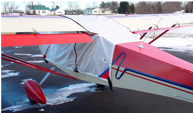
Kitfox IV Over-the-top Canopy Cover

This cover type is made from Silver Acrylic Sunbrella canvas and is 100% lined with a soft and smooth microfiber. Bruce's Custom Covers developed this material combination especially for aircraft protection. The outer material is medium weight and treated for water resistance, UV resistance and anti-static buildup. The inner lining is a very soft and smooth microfiber to prevent scratching. The material is very reflective, and tests show that the cabin interior temperature can be reduced to near-ambient temperature on the hottest of days. It is water, ice and snow repellent, yet breathable to allow moisture to escape from between the cover and the aircraft surface.