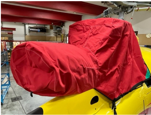
Airbus Helicopter H-125 & AS350 Intake/Exhaust Cover (newer design)

WINTER USE MATERIAL - Made with Solution-Dyed Polyester fabric, this option is intended for seasonal use to aid in deicing, rain mitigation, or for occasional travel. The material is lighter and more compact, but more susceptible to UV damage and may have a shorter useful life if used continuously outside than the all-year use material.