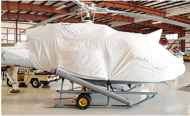
Eurocopter AS350 Main Body Cover

water resistance, UV resistance and anti-static buildup. The inner lining is a very soft and smooth microfiber to prevent scratching. The material is very reflective, and tests show that the cabin interior temperature can be reduced to near-ambient temperature on the hottest of days. It is water, ice and snow repellent, yet breathable to allow moisture to escape from between the cover and the aircraft surface.