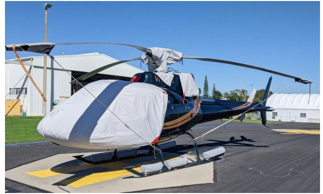
AS350 Bubble, Main Rotor, Intake & Tail Rotor Covers