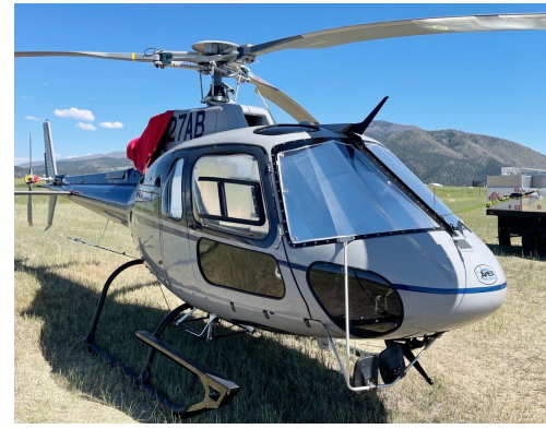
Eurocopter AS350-B3 Cabin HeatShields, Intake/Exhaust Cover Eurocopter AS350-B3 Cabin HeatShields, Intake/Exhaust Cover