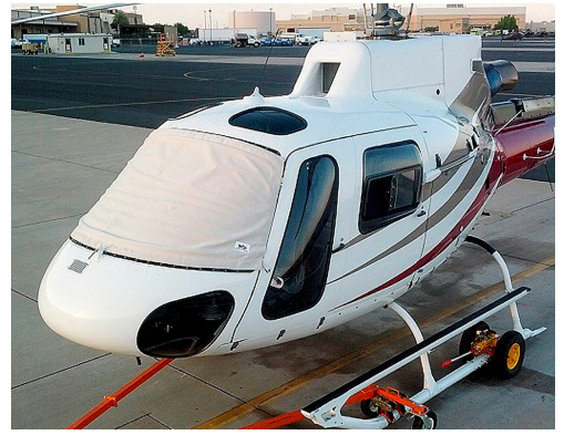
AS350 Windshield Cover, pinches in door jambs