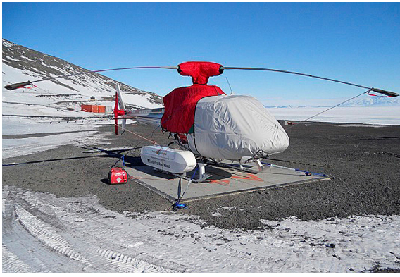
AS350 Bubble Cover w/ Cargo Mirror, Blade Tie-downs, Insulated Engine, Insulated Main Rotor Hub & Insulated Tail Rotor Covers