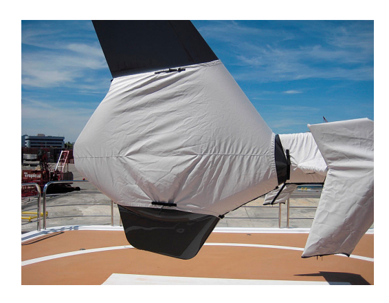
EC-135 Tailfan Cover and Tailboom Stabilizer Cover