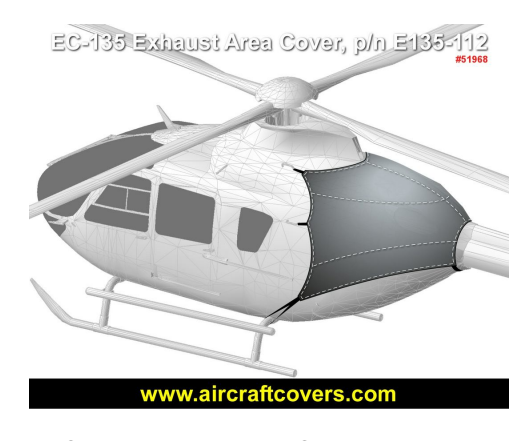
EC135 Exhaust Area Cover, illustration

The Airbus Helicopter EC-135 Intake Cover. Details vary by model, but generally helicopter intake covers are designed to enclose the intake are only. They are smaller than helicopter engine covers, and their attachment details can vary from straps, to snaps, or some combination of the two. Specific information for each model is available on request.