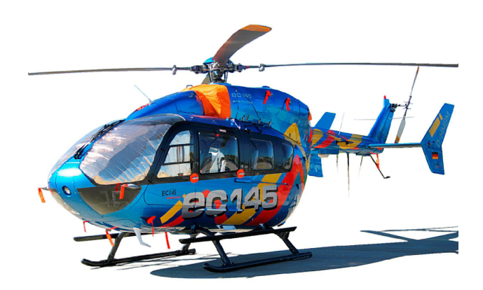
EC-145 Cabin Heatshield Set

Heatshields are interior sunshades for an aircraft's windows or canopy glass. The product is a unique composite of closed-cell foam with a silver mylar finish. The semi-rigid design is stiff enough to stand along the inside of the windshield using sun visors or window framing. It folds up flat and easily stores in the included storage sleeve. Some designs may require velcro and suction cups. A Heatshield is an excellent short-term remedy for cockpit overheating.