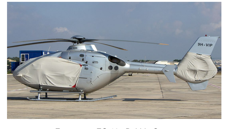
EC-135 Full Cover Set