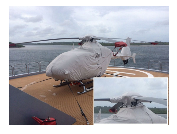
Airbus Helicopter AH135 Main Rotor Hub Cover