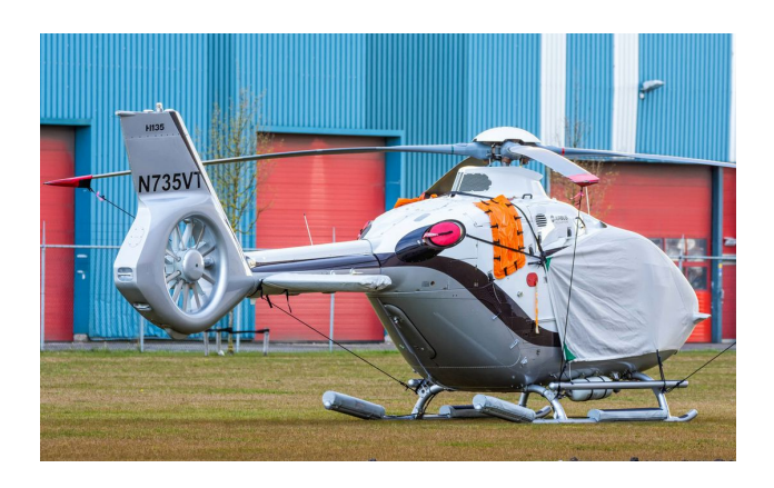
Airbus EC135T3 Blade Tie-Downs