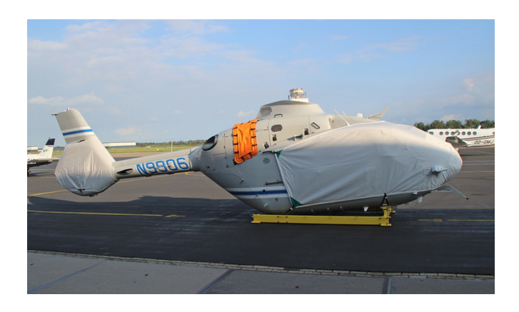
Eurocopter EC-135 Bubble & Tailfan Covers

The Tailboom Cover details vary by model, but generally the helicopter tail boom cover encloses the tail boom from the "bottleneck" to the aft end. They usually also cover the horizontal stabilizers, and are custom made to allow for antennae, lights, and other protrusions. They attach with straps underneath the tail boom. Covers for the vertical and horizontal stabilizers are also available separately. Specific information for each model is available on request.