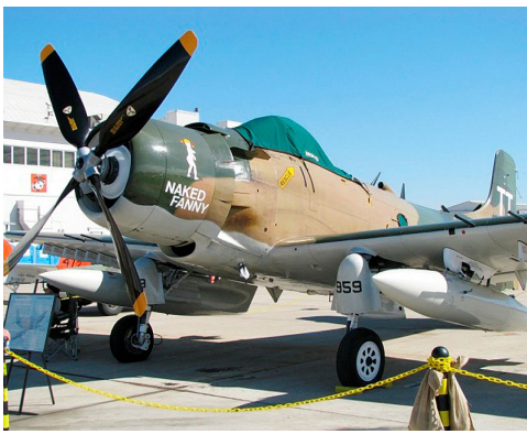
Douglas Skyraider Canopy Cover