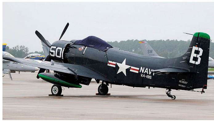
Douglas Skyraider Canopy Cover