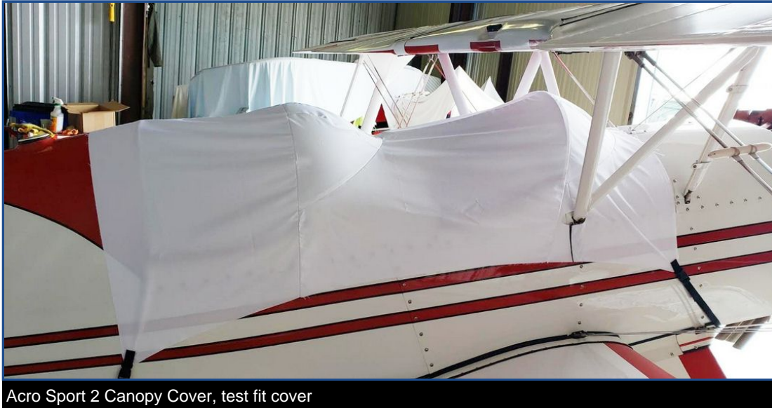
Acro Sport 2 Canopy Cover, test fit cover