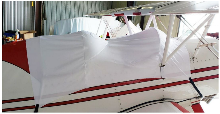
Acro Sport 2 Canopy Cover, test fit cover