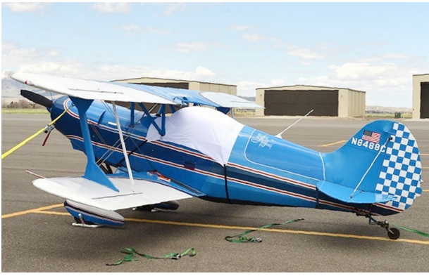
Acro Sport Canopy Cover