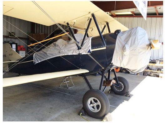
Acro Sport Acro II, Acroduster Travel Cover, Light Weight Travel Canopy Cover