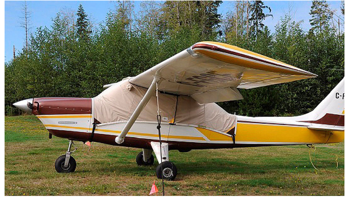
Lark Canopy Cover