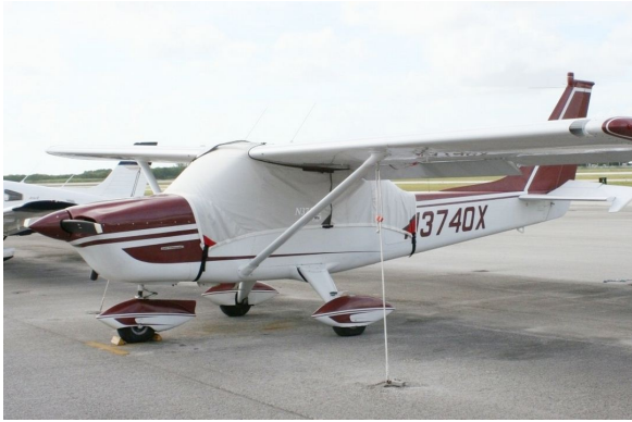
Rockwell Lark Commander Canopy Cover