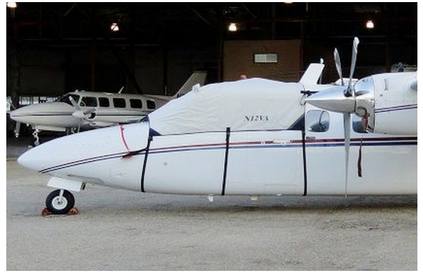
Rockwell Aero Commander 685, 690 & 840 Cockpit Cover