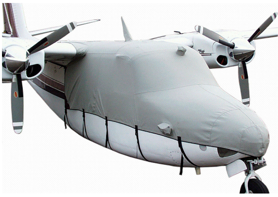
Canopy/Nose Cover (extends over top past leading edge)