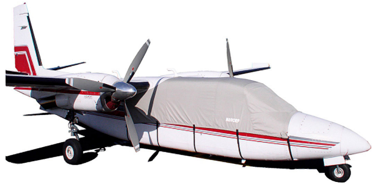
Aero Commander 690b Canopy Cover