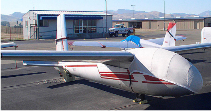
Blanik L13 Canopy/Nose Cover