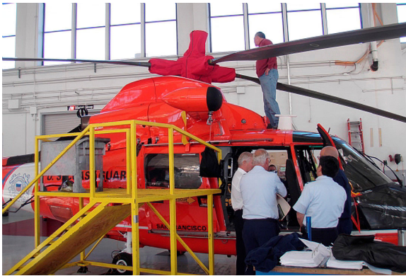
MH-65C Rotor Hub Cover w/ OADS Tube Cover detail

Insulated Covers Material - A special composite material of solution-dyed polyester, 3M Thinsulate insulation, and soft nylon interior fabric. Our insulated covers are designed to complement an engine preheater and help retain heat in the engine compartment after shutdown. If you operate your aircraft in cold-weather, these covers will help prevent engine wear and tear.