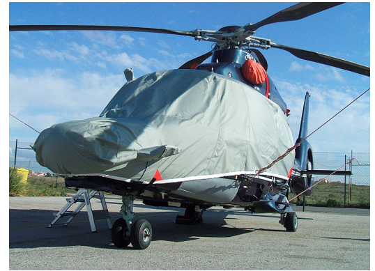
Dauphin Bubble Cover, extended nose