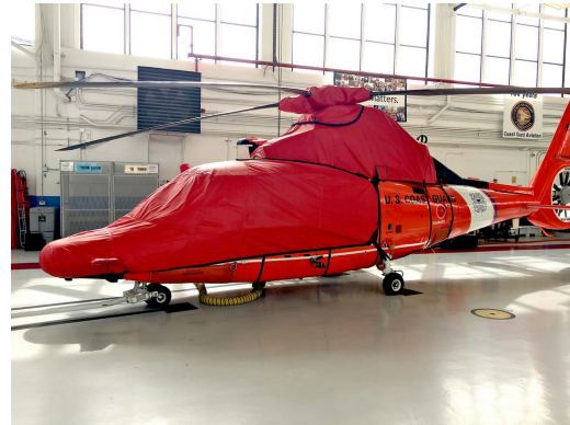
Aerospatiale AS365N2 Bubble, w/Extended Nose/Radome U.S. Coast Guard HH-65 Dolphin Bubble, Engine & Rotor Mast Covers