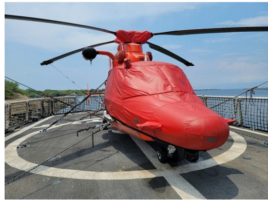
Aerospatiale AS365N2 Bubble, w/Extended Nose/Radome