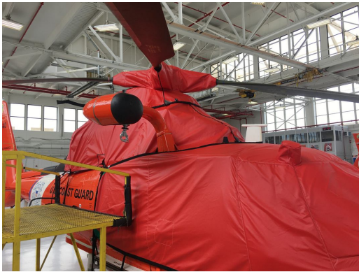
U.S. Coast Guard HH-65 Dolphin Bubble, Engine & Rotor Mast Covers

Travel Covers are made with Silver Solution-Dyed Polyester fabric and fully lined over the entire cover. The material is lightweight and more compact for easy storage in the aircraft. The polyester material is water resistant, but only intended for occasional use outside. We also have an ultra lightweight material available for fitted hangar dust covers. For daily outdoor use, the non-travel Sunbrella Cover is the best choice.