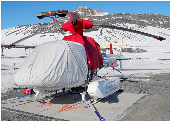
AS350 Bubble Cover w/ Cargo Mirror, Blade Tie-downs, Insulated Engine, Insulated Main Rotor Hub and Insulated Tail Rotor Covers

WINTER USE MATERIAL - Made with Solution-Dyed Polyester fabric, this option is intended for seasonal use to aid in deicing, rain mitigation, or for occasional travel. The material is lighter and more compact, but more susceptible to UV damage and may have a shorter useful life if used continuously outside than the all-year use material.