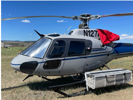
Eurocopter AS350-B3 Cabin HeatShields, Intake/Exhaust Cover

Heatshields are interior sunshades for an aircraft's windows or canopy glass. The product is a unique composite of closed-cell foam with a silver mylar finish. The semi-rigid design is stiff enough to stand along the inside of the windshield using sun visors or window framing. It folds up flat and easily stores in the included storage sleeve. Some designs may require velcro and suction cups. A Heatshield is an excellent short-term remedy for cockpit overheating.