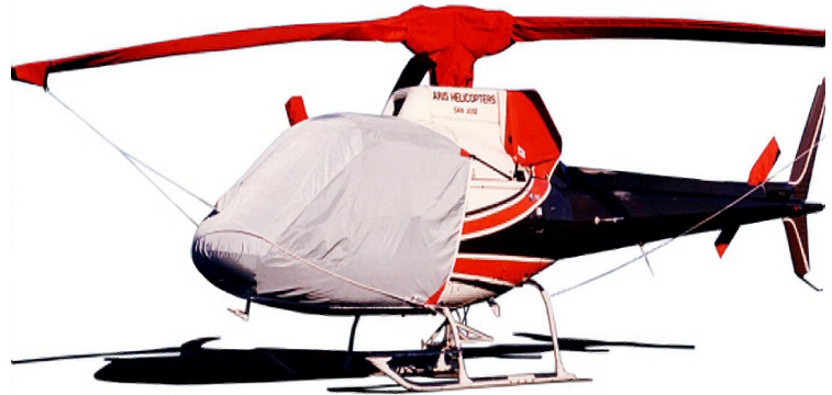
Bubble Cover, Intake/Exhaust, Rotor Mast, Tail Rotor & Main Body Covers