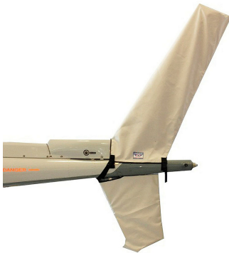
AS350B3 Vertical Stabilizers cover

The Tailboom Cover details vary by model, but generally the helicopter tail boom cover encloses the tail boom from the "bottleneck" to the aft end. They usually also cover the horizontal stabilizers, and are custom made to allow for antennae, lights, and other protrusions. They attach with straps underneath the tail boom. Covers for the vertical and horizontal stabilizers are also available separately. Specific information for each model is available on request.