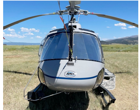
Eurocopter AS350-B3 Cabin HeatShields