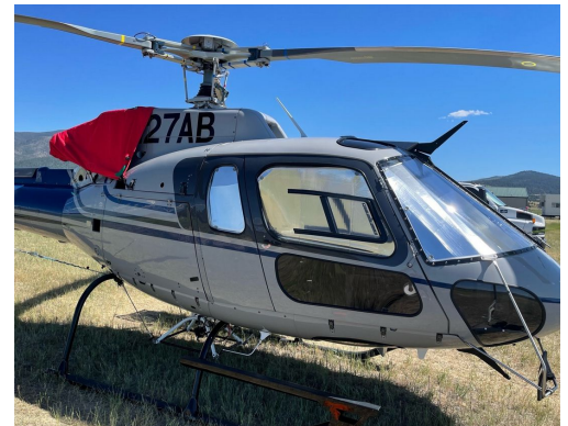
Eurocopter AS350-B3 Cabin HeatShields, Intake/Exhaust Cover