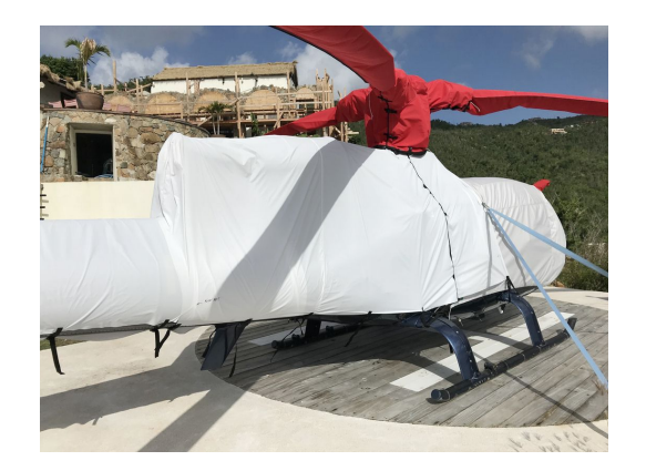
Aerospatiale AS341/342 Gazelle Full Cover Set