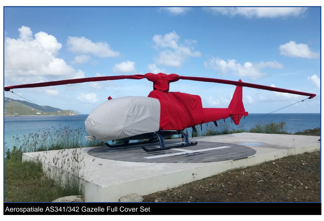
Section 1: Cockpit/Bubble Covers