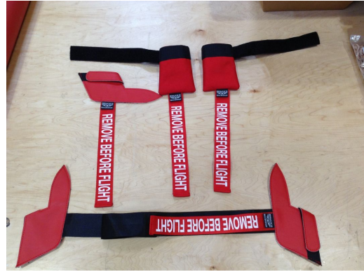
Airbus A319 Pitot & Tat Covers, Heat Resistant Type