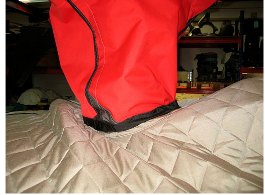
Alouette III Rotor Hub Cover, Insulated Engine/Transmission Cover Alouette III Rotor Hub Cover & Engine/Transmission Cover