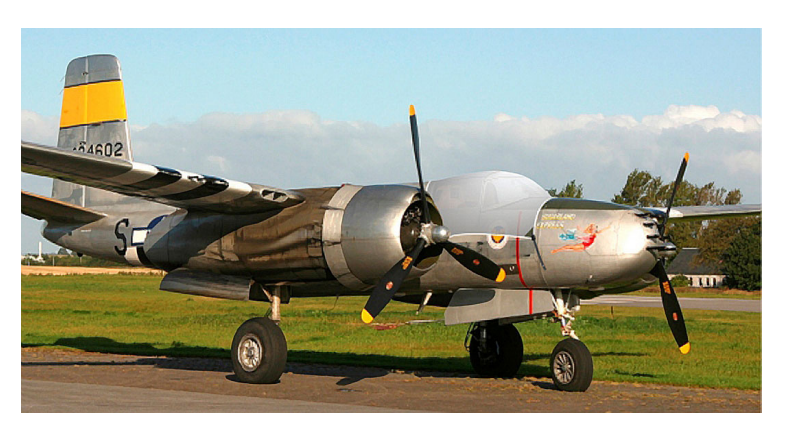
A-26 Invader Cockpit Cover (Illustration)