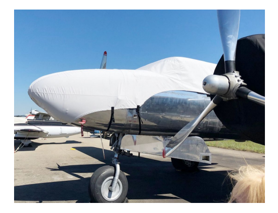
Douglas A26 Invader Cockpit/Nose Cover

the hottest of days. It is water, ice and snow repellent, yet breathable to allow moisture to escape from between the cover and the aircraft surface.