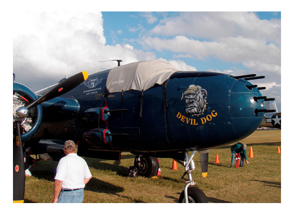
Mitchell B25 Cockpit Cover w/ Custom Imprint (Bellystrap Type)