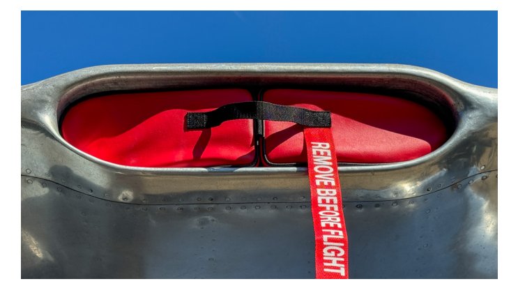
Douglas A26 Invader Oil Cooler Inlet Plugs

Engine Inlet Plugs are custom fit for your Douglas A26 Invader intakes, made with heavy-duty vinyl material, and stuffed with a single block of sculpted urethane foam. Each plug has a zipper that allows the foam to be removed and dried if necessary. Engine plugs have warning flags that are visible from the cockpit or 'remove before flight' streamers sewn onto the face of the plugs. Most plugs are imprinted with the aircraft registration number in black for an extra charge. Storage bag NOT included. Engine plugs may be inserted after flight when the engine is still warm. Engine Inlet Plugs are commonly referred to as Cowl Plugs, Intake Plugs, Cowl Blocks, Engine Blocks, and Engine Bungs.