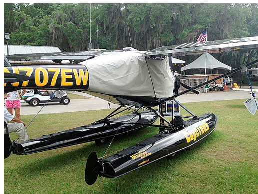
A-22 Over-the-Top Canopy Cover