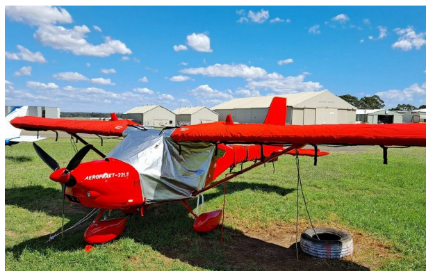
Aeroprakt A22 Wing & Empennage Covers