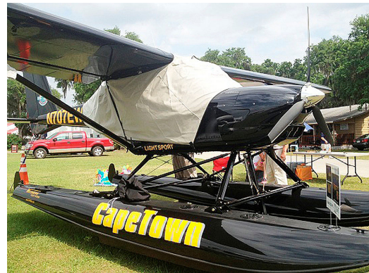
A-22 Over-the-Top Canopy Cover