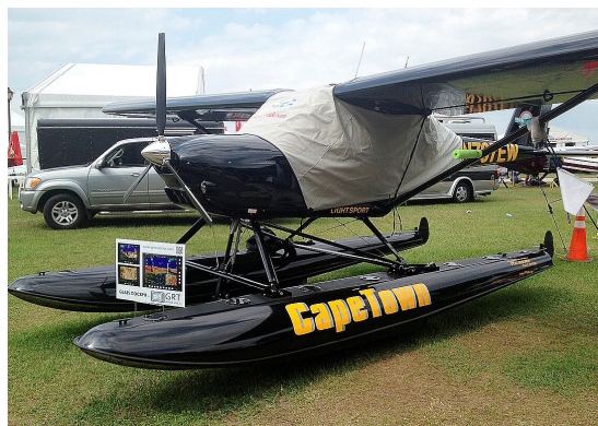
A-22 Over-the-Top Canopy Cover

This cover type is made from Silver Acrylic Sunbrella canvas and is 100% lined with a soft and smooth microfiber. Bruce's Custom Covers developed this material combination especially for aircraft protection. The outer material is medium weight and treated for water resistance, UV resistance and anti-static buildup. The inner lining is a very soft and smooth microfiber to prevent scratching. The material is very reflective, and tests show that the cabin interior temperature can be reduced to near-ambient temperature on the hottest of days. It is water, ice and snow repellent, yet breathable to allow moisture to escape from between the cover and the aircraft surface.