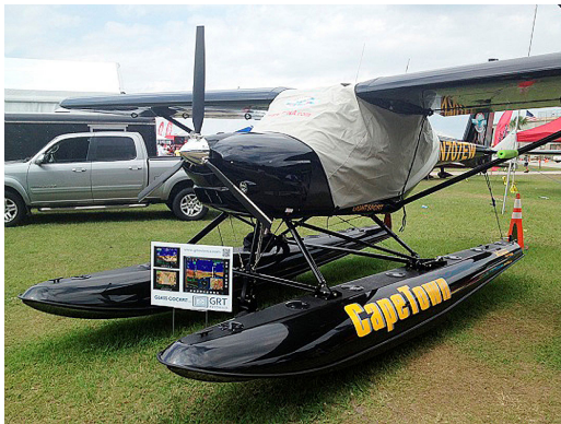
A-22 Over-the-Top Canopy Cover

Travel Covers are made with Silver Solution-Dyed Polyester fabric and only lined over the windshield to save weight. The material is lightweight and more compact for easy stowage in the aircraft. The polyester material is water resistant, but only intended for occasional use outside. We also have an ultra lightweight material available for fitted hangar dust covers. For daily outdoor use, the non-travel Sunbrella Cover is the best choice.