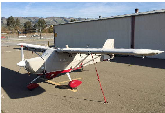
Eurofox Canopy, Engine, Wings and Empennage Covers

WINTER USE MATERIAL - Made with Solution-Dyed Polyester fabric, this option is intended for seasonal use to aid in deicing, rain mitigation, or for occasional travel. The material is lighter and more compact, but more susceptible to UV damage and may have a shorter useful life if used continuously outside than the all-year use material.