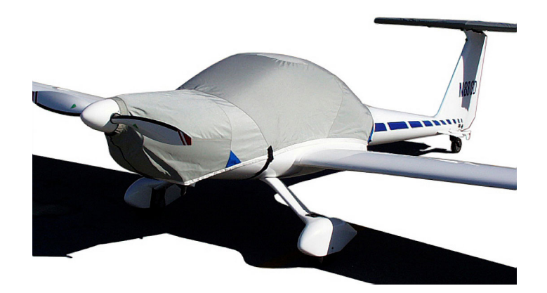
Diamond DA-20 Canopy/Engine Cover

This cover type is made from Silver Acrylic Sunbrella canvas and is 100% lined with a soft and smooth microfiber. Bruce's Custom Covers developed this material combination especially for aircraft protection. The outer material is medium weight and treated for water resistance, UV resistance and anti-static buildup. The inner lining is a very soft and smooth microfiber to prevent scratching. The material is very reflective, and tests show that the cabin interior temperature can be reduced to near-ambient temperature on the hottest of days. It is water, ice and snow repellent, yet breathable to allow moisture to escape from between the cover and the aircraft surface.