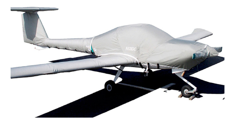
Diamond DA-20 Full Cover Set

WINTER USE MATERIAL - Made with Solution-Dyed Polyester fabric, this option is intended for seasonal use to aid in deicing, rain mitigation, or for occasional travel. The material is lighter and more compact, but more susceptible to UV damage and may have a shorter useful life if used continuously outside than the all-year use material.