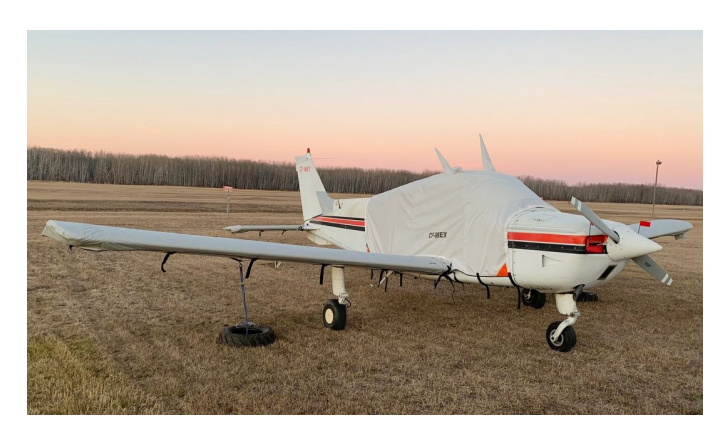
Sport B19 Engine Inlet Plugs

WINTER USE MATERIAL - Made with Solution-Dyed Polyester fabric, this option is intended for seasonal use to aid in deicing, rain mitigation, or for occasional travel. The material is lighter and more compact, but more susceptible to UV damage and may have a shorter useful life if used continuously outside than the all-year use material.