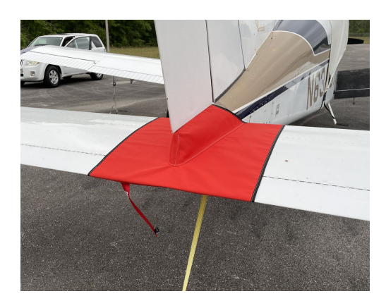
Beech C23 Tailcone Cover, Fully Enclosed