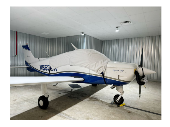
Beech Sport A19 Canopy Cover