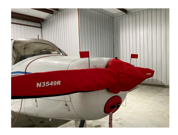
Beech A23 Musketeer Insulated Prop Cover, Engine Plugs