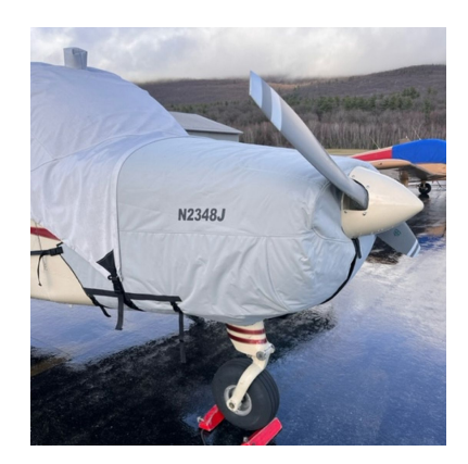
Beech Musketeer Insulated Engine Cover

This cover type is made from Silver Acrylic Sunbrella canvas and is 100% lined with a soft and smooth microfiber. Bruce's Custom Covers developed this material combination especially for aircraft protection. The outer material is medium weight and treated for water resistance, UV resistance and anti-static buildup. The inner lining is a very soft and smooth microfiber to prevent scratching. The material is very reflective, and tests show that the cabin interior temperature can be reduced to near-ambient temperature on the hottest of days. It is water, ice and snow repellent, yet breathable to allow moisture to escape from between the cover and the aircraft surface.