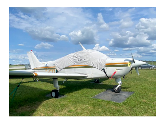
Beech Sport A19 Canopy Cover

This cover type is made from Silver Acrylic Sunbrella canvas and is 100% lined with a soft and smooth microfiber. Bruce's Custom Covers developed this material combination especially for aircraft protection. The outer material is medium weight and treated for water resistance, UV resistance and anti-static buildup. The inner lining is a very soft and smooth microfiber to prevent scratching. The material is very reflective, and tests show that the cabin interior temperature can be reduced to near-ambient temperature on the hottest of days. It is water, ice and snow repellent, yet breathable to allow moisture to escape from between the cover and the aircraft surface.