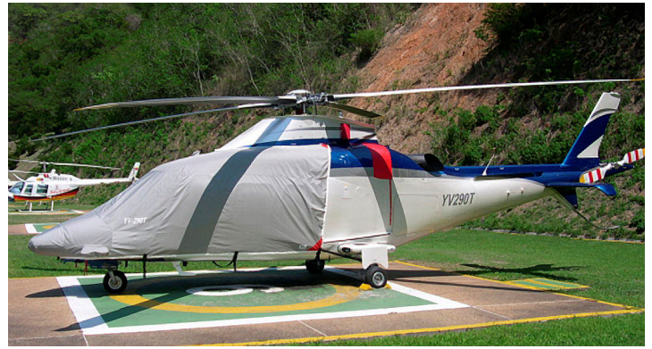
Agusta Grand Bubble Cover