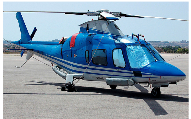
Agusta Power Cockpit HeatShields & Blade Tie-downs