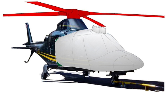
Agusta 109 Bubble, Rotor Hub & Blade Covers (illustration)