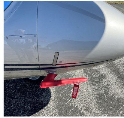
Agusta AW109 (A, C, & Trekker) Pitot Cover Set