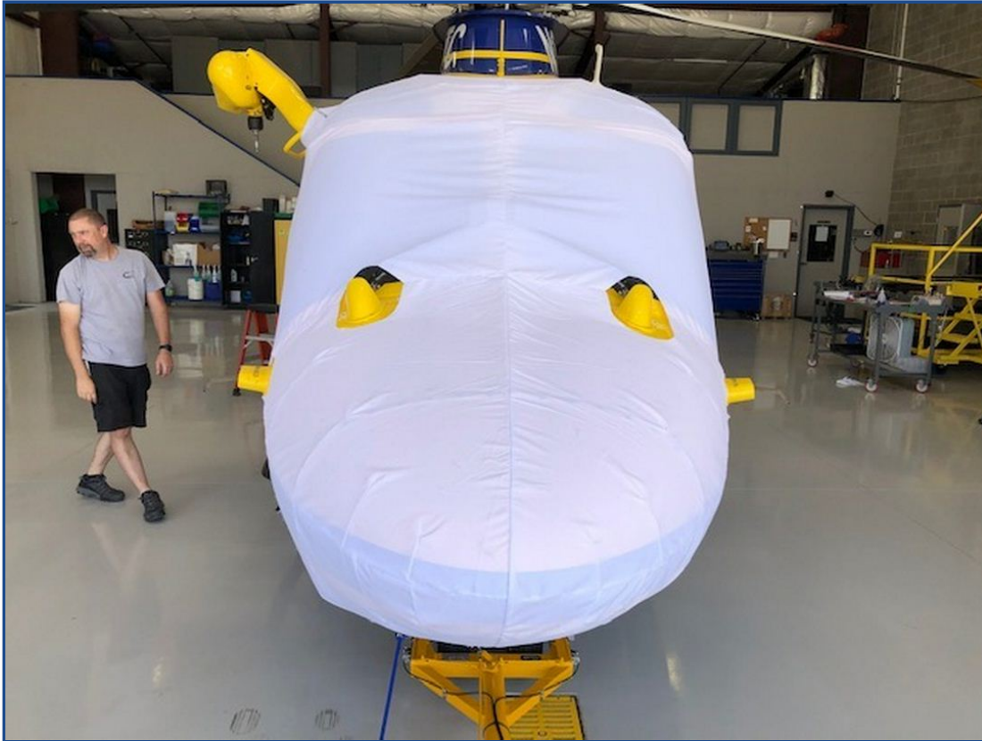
Leonardo (Agusta) A-169 Bubble Cover, test fit cover