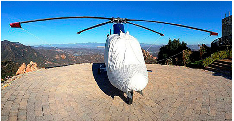
Agusta 109 Mk II+ Bubble Cover and Blade Tie-downs