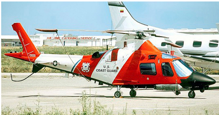
Covers, Plugs, HeatShields and related items for the Agusta MH-68A

Cockpit Heatshields are interior sunshades for the aircraft's cockpit. The product is a unique composite of closed-cell foam with a silver mylar finish. The semi-rigid design is stiff enough to stand inside the window framing. Darts and folds are incorporated into the material so that it conforms to the complex shape of the helicopter windows. The set folds up flat and is easily stored in the included storage sleeve. Some designs may require velcro and suction cups. A Heatshield is an excellent short-term remedy for cockpit overheating, but an external fabric cover is more effective for long-term protection.