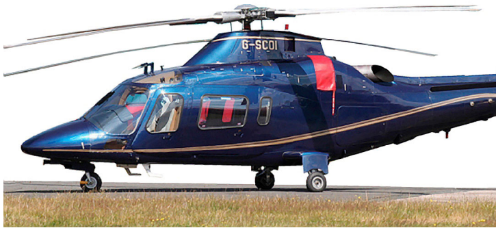
Agusta Power Intake Cover

WINTER USE MATERIAL - Made with Solution-Dyed Polyester fabric, this option is intended for seasonal use to aid in deicing, rain mitigation, or for occasional travel. The material is lighter and more compact, but more susceptible to UV damage and may have a shorter useful life if used continuously outside than the all-year use material.