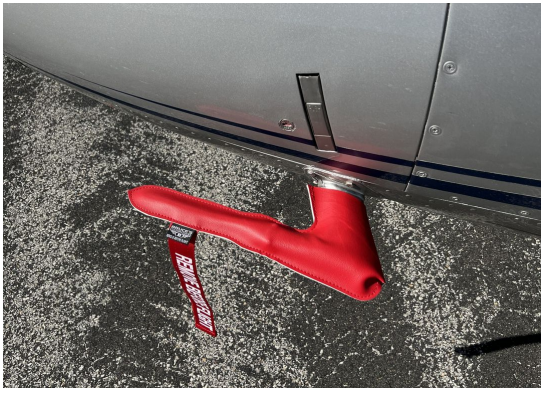
Agusta AW109 (A, C, & Trekker) Pitot Cover Set