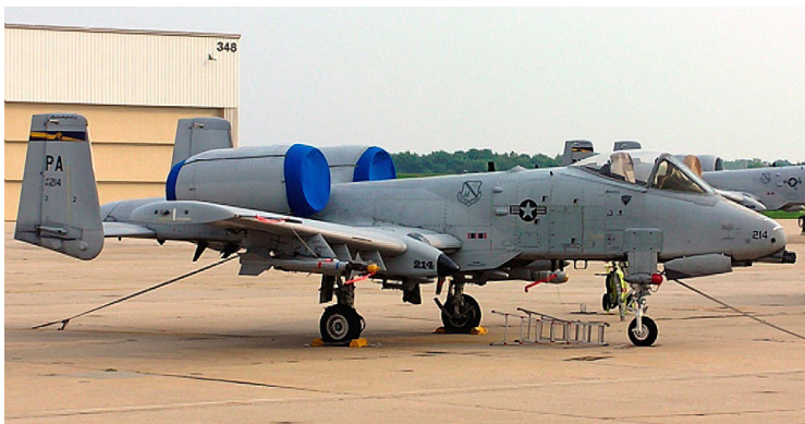
A-10 Engine Covers

ALL-YEAR USE MATERIAL - Made with Solution dyed Polyester fabric, the all-year use material is the best option for sun protection and cover longevity. This heavier more durable material is intended for all weather conditions, such as rain and snow or lots of sun.