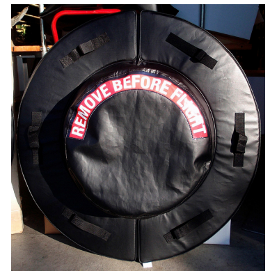
A-10 Exhaust Plug/Cover