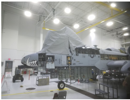
Fairchild A-10 Canopy Cover, open position