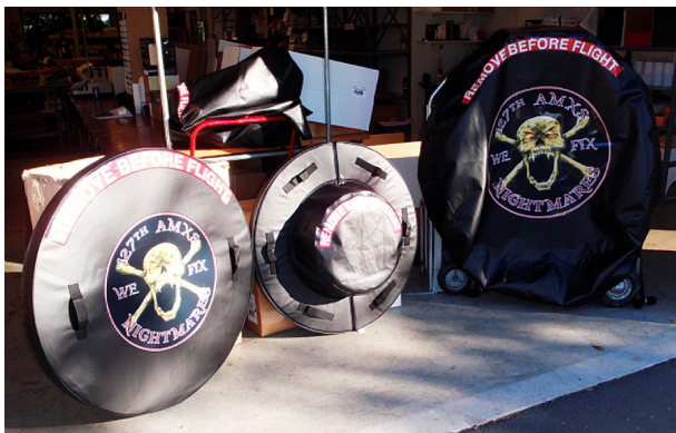
A-10 Engine Intake Plug, Exhaust Plug/Cover, Intake Cover (from left to right)

The Engine Inlet Plugs are custom fit for your Fairchild A10 Thunderbolt intakes, made with heavy-duty vinyl material, and stuffed with a single block of sculpted urethane foam. Each plug has a zipper that allows the foam to be removed and dried if necessary. Engine plugs have 'remove before flight' streamers sewn onto the face of the plugs. Most plugs are imprinted with the aircraft registration number in black for an extra charge. Storage bag NOT included. Engine plugs may be inserted after flight when the engine is still warm. Engine Inlet Plugs are commonly referred to as Cowl Plugs, Intake Plugs, Cowl Blocks, Engine Blocks, and Engine Bungs.