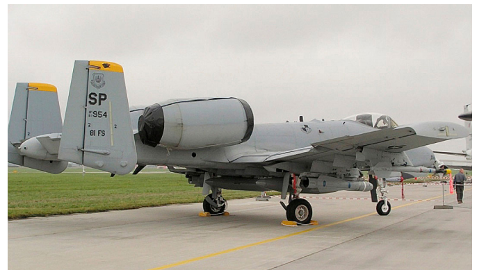
A-10 Engine Covers