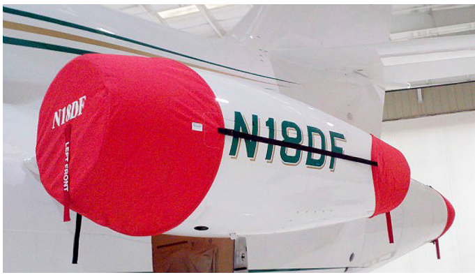
Falcon 900 Engine Cover Set