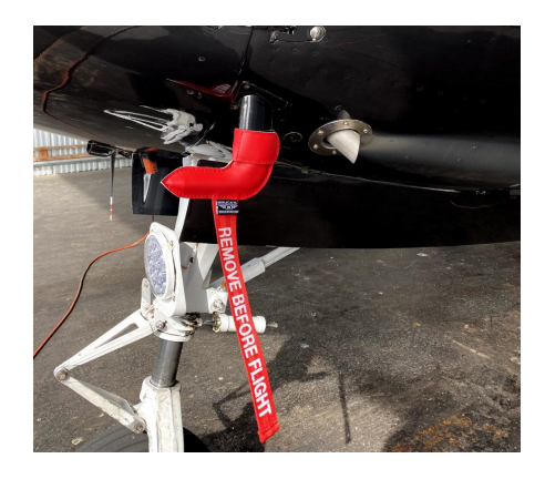
Baron 58 Pitot Cover

Engine Inlet Plugs are custom fit for your Beech Baron 58TC intakes, made with heavy-duty vinyl material, and stuffed with a single block of sculpted urethane foam. Each plug has a zipper that allows the foam to be removed and dried if necessary. Engine plugs have warning flags that are visible from the cockpit or 'remove before flight' streamers sewn onto the face of the plugs. Most plugs are imprinted with the aircraft registration number in black for an extra charge. Storage bag NOT included. Engine plugs may be inserted after flight when the engine is still warm. Engine Inlet Plugs are commonly referred to as Cowl Plugs, Intake Plugs, Cowl Blocks, Engine Blocks, and Engine Bungs.