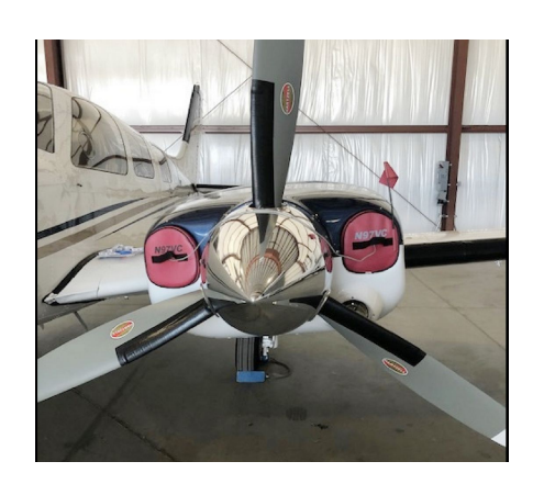
Beech Baron 58P Engine Inlet Plugs