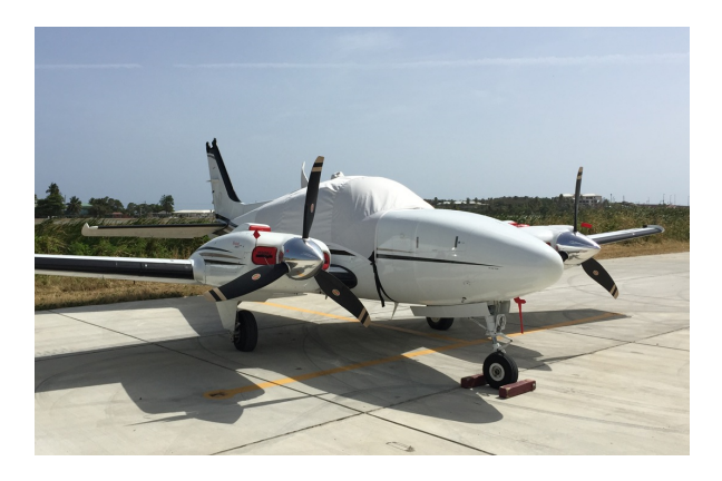
Baron 58 Canopy Cover, Engine Plugs