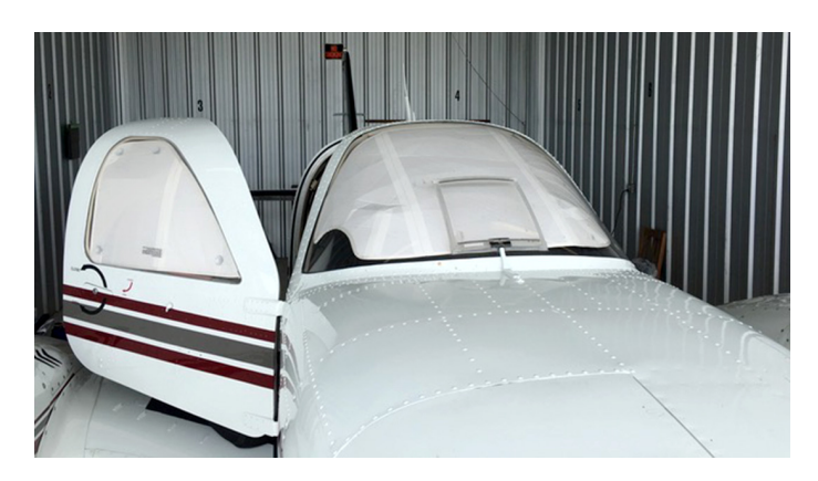
Beech Baron 58P Cockpit Heatshield Set