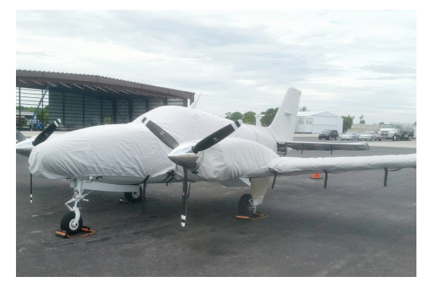
Full Cover Set (58P-020, 58P-225, 58P-405)

WINTER USE MATERIAL - Made with Solution-Dyed Polyester fabric, this option is intended for seasonal use to aid in deicing, rain mitigation, or for occasional travel. The material is lighter and more compact, but more susceptible to UV damage and may have a shorter useful life if used continuously outside than the all-year use material.