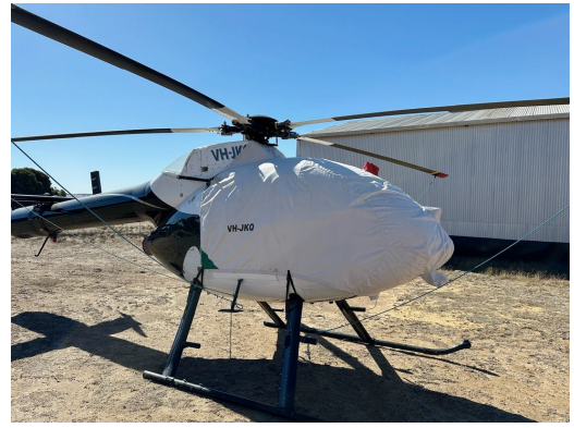
MDD 520 NOTAR Bubble Cover w/Intake Cover Add-On, Exhaust Cover MDD 520 NOTAR Bubble Cover w/Intake Cover Add-On