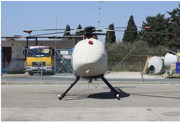
MD-500E Bubble Cover, Blade Tie-Downs