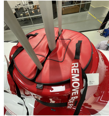
Bell 505 Swash Plate Plug