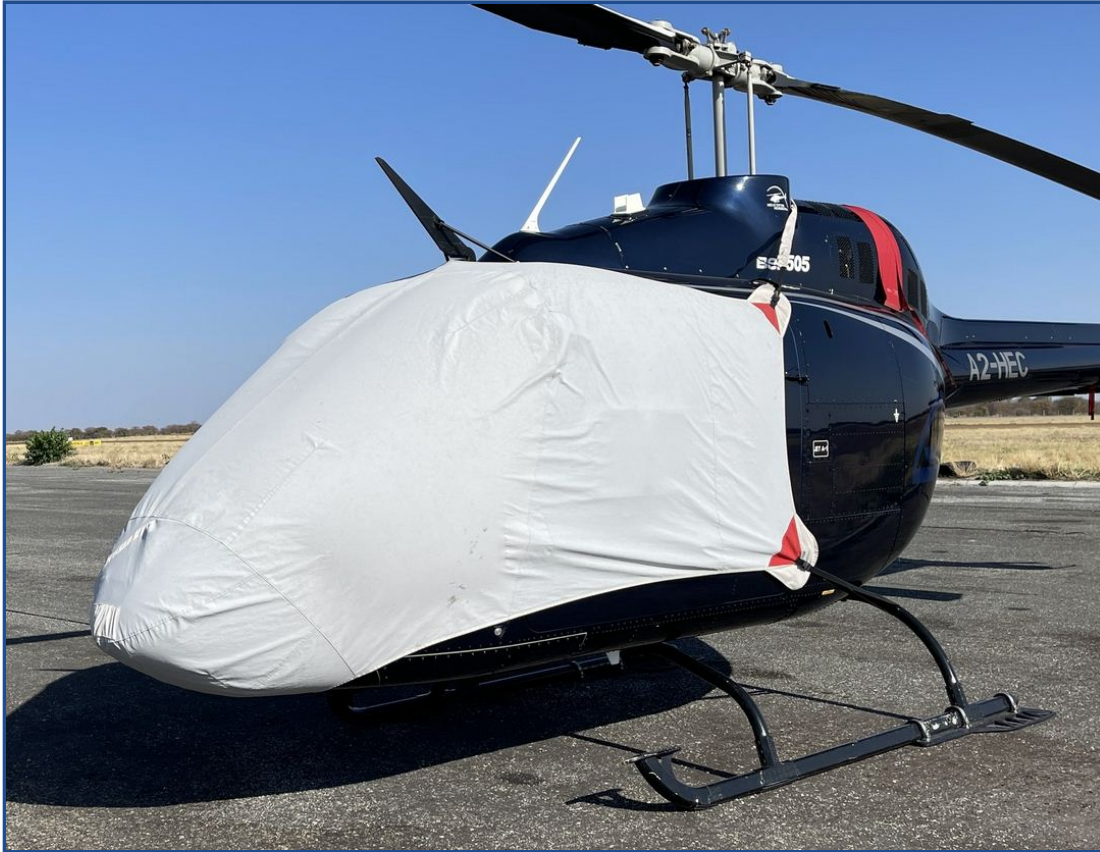
Bell 505 Bubble Cover, with Wire Strike