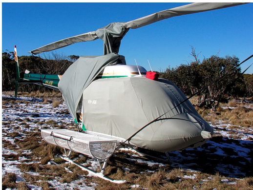
JetRanger Bubble, Engine, Rotor Hub & Blade Covers (& Tie-Downs)

Travel Covers are made with Silver Solution-Dyed Polyester fabric and fully lined over the entire cover. The material is lightweight and more compact for easy storage in the aircraft. The polyester material is water resistant, but only intended for occasional use outside. We also have an ultra lightweight material available for fitted hangar dust covers. For daily outdoor use, the non-travel Sunbrella Cover is the best choice.