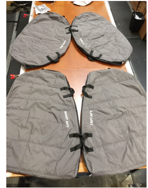
MD 500D Padded Door Bags