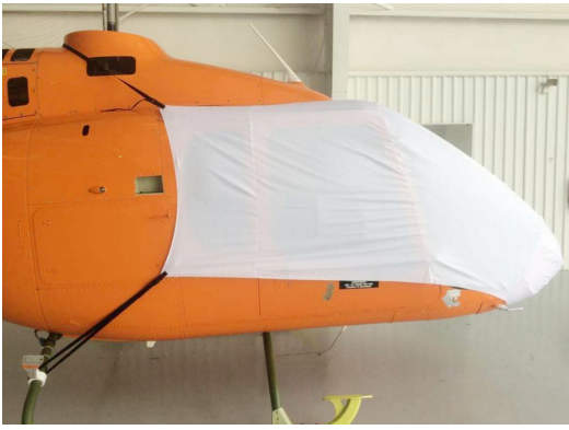
Bell 505 Bubble Cover, test fit cover.