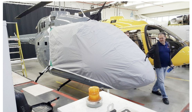
Bell 505 Bubble Cover