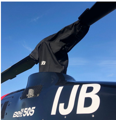
Bell 505 Rotor Mast & Blade Covers

WINTER USE MATERIAL - Made with Solution-Dyed Polyester fabric, this option is intended for seasonal use to aid in deicing, rain mitigation, or for occasional travel. The material is lighter and more compact, but more susceptible to UV damage and may have a shorter useful life if used continuously outside than the all-year use material.