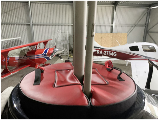
Bell 505 Jet Ranger X Swash Plate Plug

The Engine Inlet Plugs are custom fit for your Bell 505 Jet Ranger X intakes, made with heavy-duty vinyl material, and stuffed with a single block of sculpted urethane foam. Each plug has a zipper that allows the foam to be removed and dried if necessary. Engine plugs have 'Remove Before Flight' streamers sewn onto the face of the plugs. Most plugs are imprinted with the aircraft registration number in black for an extra charge. Storage bag NOT included. Engine plugs may be inserted after flight when the engine is still warm. Engine Inlet Plugs are commonly referred to as Cowl Plugs, Intake Plugs, Cowl Blocks, Engine Blocks, and Engine Bungs.