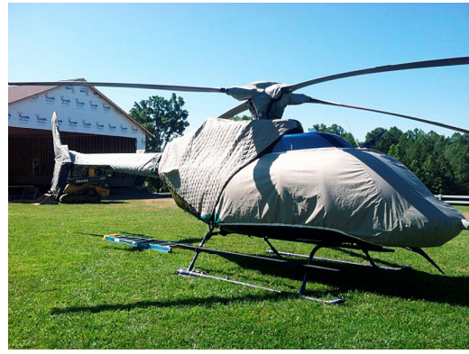
Bell 407 Covers: Bubble, Insulated Engine, Rotor Mast, Blades, Tailboom, Vertical Stabilizer and Tail Rotor