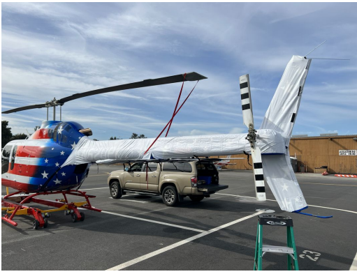
Bell 505 Tailboom & Stabilizer Covers, test fit cover