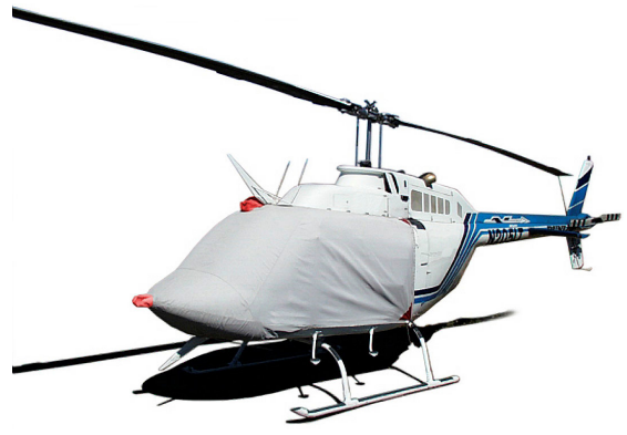
JetRanger Bubble Cover