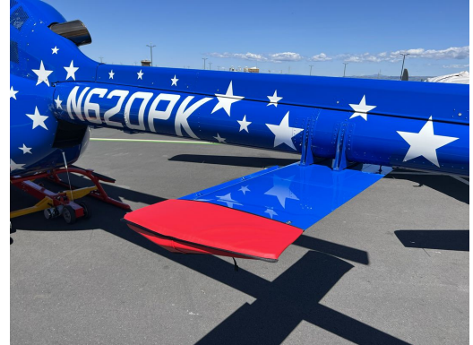
Bell 505 Horizontal Stabilizer Tip Pads