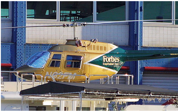
Bell 206B Jetranger Windshield HeatShields

Heatshields are interior sunshades for an aircraft's windows or canopy glass. The product is a unique composite of closed-cell foam with a silver mylar finish. The semi-rigid design is stiff enough to stand along the inside of the windshield using sun visors or window framing. It folds up flat and easily stores in the included storage sleeve. Some designs may require velcro and suction cups. A Heatshield is an excellent short-term remedy for cockpit overheating.