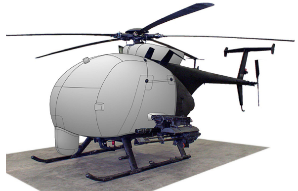
MH-6J Bubble, Flir & Doghouse Covers (illustration)