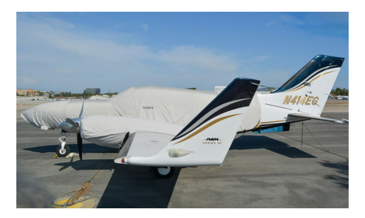
Cessna 414A Extended Canopy/Nose Cover & Engine Covers