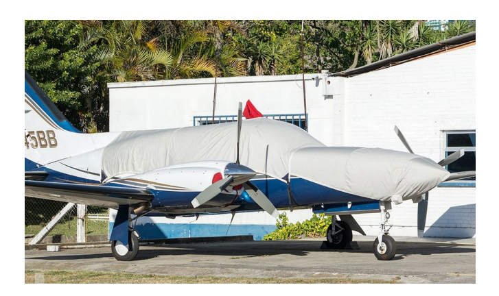
Cessna 421 Canopy Cover & Nose Cover

Travel Covers are made with Silver Solution-Dyed Polyester fabric and only lined over the windshield to save weight. The material is lightweight and more compact for easy stowage in the aircraft. The polyester material is water resistant, but only intended for occasional use outside. We also have an ultra lightweight material available for fitted hangar dust covers. For daily outdoor use, the non-travel Sunbrella Cover is the best choice.