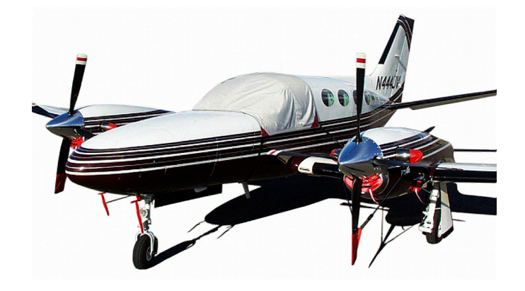
Cessna 425 Cockpit Cover