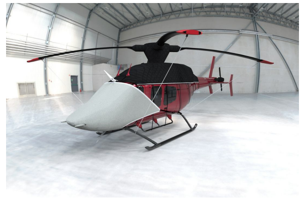
Bell 429 Cockpit/Nose Cover, Engine Cover, etc.