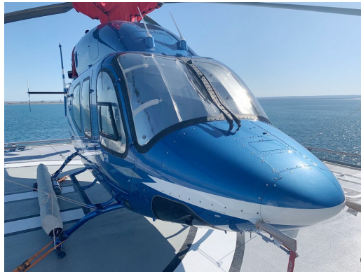
Bell 429 Cockpit HeatShields

Cockpit Heatshields are interior sunshades for the aircraft's cockpit. The product is a unique composite of closed-cell foam with a silver mylar finish. The semi-rigid design is stiff enough to stand inside the window framing. Darts and folds are incorporated into the material so that it conforms to the complex shape of the helicopter windows. The set folds up flat and is easily stored in the included storage sleeve. Some designs may require velcro and suction cups. A Heatshield is an excellent short-term remedy for cockpit overheating, but an external fabric cover is more effective for long-term protection.