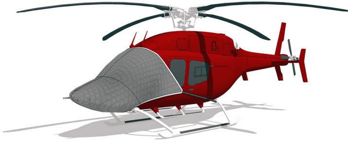
Bell 429 Insulated Cockpit/Nose Cover