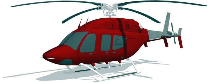
Bell 429 Insulated Tailboom Cover