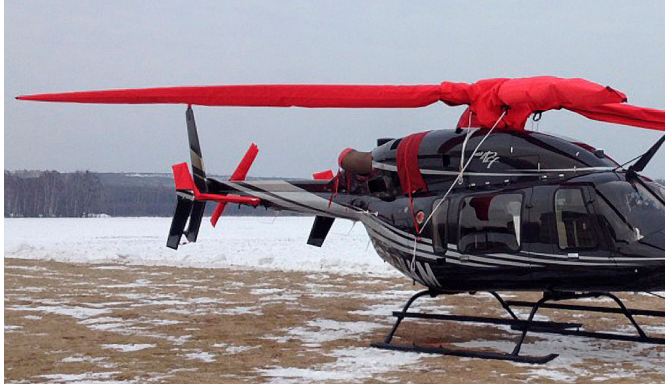
Bell 427 Rotor Blades, Main Rotor Hub/Drive Shafts, Horiz. Stabs, Tail Rotor Covers

WINTER USE MATERIAL - Made with Solution-Dyed Polyester fabric, this option is intended for seasonal use to aid in deicing, rain mitigation, or for occasional travel. The material is lighter and more compact, but more susceptible to UV damage and may have a shorter useful life if used continuously outside than the all-year use material.