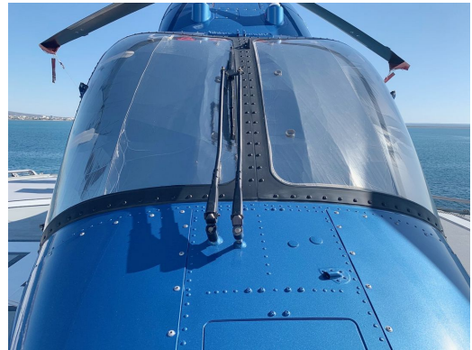
Bell 429 Windshield HeatShields