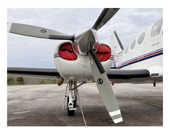
Cessna 421 Engine Inlet Plugs

Engine Inlet Plugs are custom fit for your Cessna 421 intakes, made with heavy-duty vinyl material, and stuffed with a single block of sculpted urethane foam. Each plug has a zipper that allows the foam to be removed and dried if necessary. Engine plugs have warning flags that are visible from the cockpit or 'remove before flight' streamers sewn onto the face of the plugs. Most plugs are imprinted with the aircraft registration number in black for an extra charge. Storage bag NOT included. Engine plugs may be inserted after flight when the engine is still warm. Engine Inlet Plugs are commonly referred to as Cowl Plugs, Intake Plugs, Cowl Blocks, Engine Blocks, and Engine Bungs.