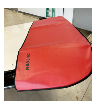
Cessna 421C Wingtip Pads

Designed to prevent damage to the aircraft extremities in crowded hangars, these products are made of bright red Naugahyde and thickly padded with a sandwich of closed cell foam.