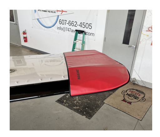
Cessna 421C Wingtip Pads