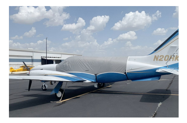
Cessna 414 Travel Weight Canopy Cover

Travel Covers are made with Silver Solution-Dyed Polyester fabric and only lined over the windshield to save weight. The material is lightweight and more compact for easy stowage in the aircraft. The polyester material is water resistant, but only intended for occasional use outside. We also have an ultra lightweight material available for fitted hangar dust covers. For daily outdoor use, the non-travel Sunbrella Cover is the best choice.