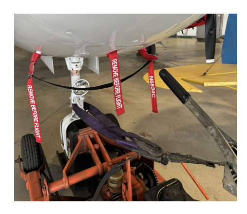
Cessna 421C Pitot Covers, Nose Inlet Plug