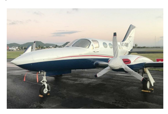
Cessna 414 Propellor/Spinner Covers, 3 Blade