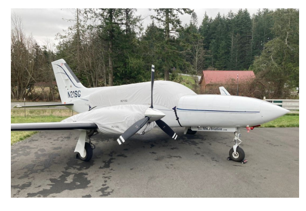
Cessna 421C Canopy & Engine Covers

This cover type is made from Silver Acrylic Sunbrella canvas and is 100% lined with a soft and smooth microfiber. Bruce's Custom Covers developed this material combination especially for aircraft protection. The outer material is medium weight and treated for water resistance, UV resistance and anti-static buildup. The inner lining is a very soft and smooth microfiber to prevent scratching. The material is very reflective, and tests show that the cabin interior temperature can be reduced to near-ambient temperature on the hottest of days. It is water, ice and snow repellent, yet breathable to allow moisture to escape from between the cover and the aircraft surface.