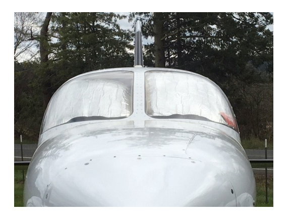
Cessna 421 Windshield HeatShields

Heatshields are interior sunshades for an aircraft's windows or canopy glass. The product is a unique composite of closed-cell foam with a silver mylar finish. The semi-rigid design is stiff enough to stand along the inside of the windshield using sun visors or window framing. It folds up flat and easily stores in the included storage sleeve. Some designs may require velcro and suction cups. A Heatshield is an excellent short-term remedy for cockpit overheating.