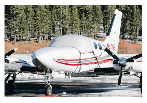
Cessna 414 Cockpit Cover