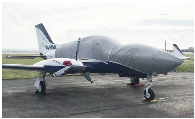
Cessna 414 Travel Cover, Light Weight Canopy Cover