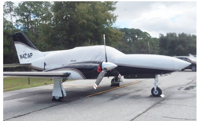
Cessna 421 Canopy Cover, Engine Plugs