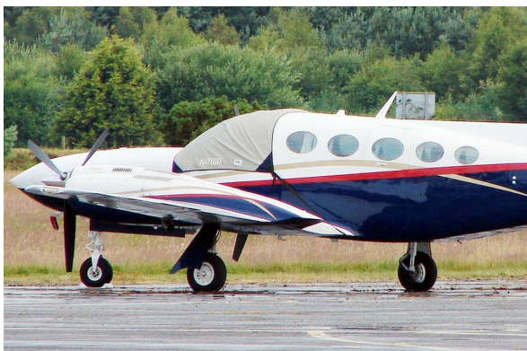
Cessna 421 Cockpit Cover

This cover type is made from Silver Acrylic Sunbrella canvas and is 100% lined with a soft and smooth microfiber. Bruce's Custom Covers developed this material combination especially for aircraft protection. The outer material is medium weight and treated for water resistance, UV resistance and anti-static buildup. The inner lining is a very soft and smooth microfiber to prevent scratching. The material is very reflective, and tests show that the cabin interior temperature can be reduced to near-ambient temperature on the hottest of days. It is water, ice and snow repellent, yet breathable to allow moisture to escape from between the cover and the aircraft surface.