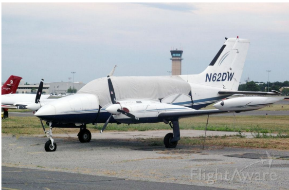
Cessna 421 Canopy Cover

The Cessna 402 Nose Cover is designed to cover the section of the fuselage forward of the windshield to the tip of the nose. It is secured with belly straps. This cover type is made from Silver Acrylic Sunbrella canvas and is 100% lined with a soft and smooth microfiber. Bruce's Custom Covers developed this material combination especially for aircraft protection. The outer material is medium weight and treated for water resistance, UV resistance and anti-static buildup. The inner lining is a very soft and smooth microfiber to prevent scratching. The material is very reflective, and tests show that the cabin interior temperature can be reduced to near-ambient temperature on the hottest of days. It is water, ice and snow repellent, yet breathable to allow moisture to escape from between the cover and the aircraft surface.