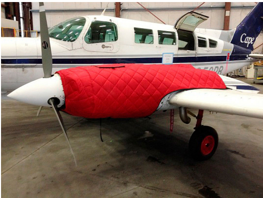
Cessna 402 Insulated Engine Cover

This cover type is made from Silver Acrylic Sunbrella canvas and is 100% lined with a soft and smooth microfiber. Bruce's Custom Covers developed this material combination especially for aircraft protection. The outer material is medium weight and treated for water resistance, UV resistance and anti-static buildup. The inner lining is a very soft and smooth microfiber to prevent scratching. The material is very reflective, and tests show that the cabin interior temperature can be reduced to near-ambient temperature on the hottest of days. It is water, ice and snow repellent, yet breathable to allow moisture to escape from between the cover and the aircraft surface.