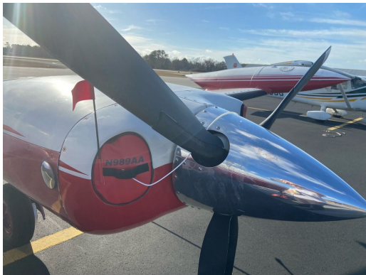
Cessna 401A Engine Inlet Plugs

Engine Inlet Plugs are custom fit for your Cessna 401 intakes, made with heavy-duty vinyl material, and stuffed with a single block of sculpted urethane foam. Each plug has a zipper that allows the foam to be removed and dried if necessary. Engine plugs have warning flags that are visible from the cockpit or 'remove before flight' streamers sewn onto the face of the plugs. Most plugs are imprinted with the aircraft registration number in black for an extra charge. Storage bag NOT included. Engine plugs may be inserted after flight when the engine is still warm. Engine Inlet Plugs are commonly referred to as Cowl Plugs, Intake Plugs, Cowl Blocks, Engine Blocks, and Engine Bungs.