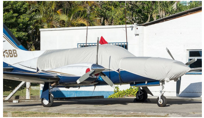
Cessna 421 Canopy Cover & Nose Cover