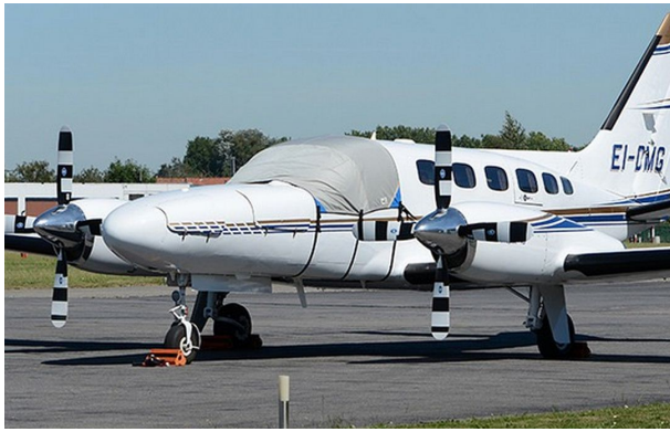
Cessna 441 Cockpit Cover