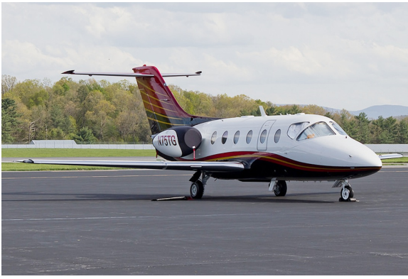
Nextant 400XTi Cockpit HeatShields, Bikini Type Engine Covers