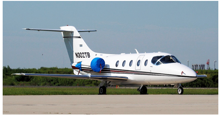
Nextant 400XTi Engine Covers in Blue