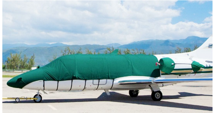
Raytheon Beechjet 400 Fuselage/Nose Cover, Engine Covers