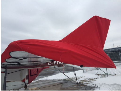
Cessna 337 Skymaster Wing Covers, with winglets

WINTER USE MATERIAL - Made with Solution-Dyed Polyester fabric, this option is intended for seasonal use to aid in deicing, rain mitigation, or for occasional travel. The material is lighter and more compact, but more susceptible to UV damage and may have a shorter useful life if used continuously outside than the all-year use material.