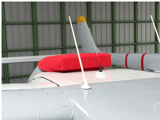
Cessna 337 Skymaster Aft Engine Inlet Cover, hoop type

This cover type is made from Silver Acrylic Sunbrella canvas and is 100% lined with a soft and smooth microfiber. Bruce's Custom Covers developed this material combination especially for aircraft protection. The outer material is medium weight and treated for water resistance, UV resistance and anti-static buildup. The inner lining is a very soft and smooth microfiber to prevent scratching. The material is very reflective, and tests show that the cabin interior temperature can be reduced to near-ambient temperature on the hottest of days. It is water, ice and snow repellent, yet breathable to allow moisture to escape from between the cover and the aircraft surface.