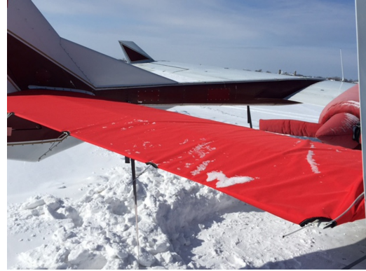
Cessna 337 Skymaster Horizontal Stabilizer Cover