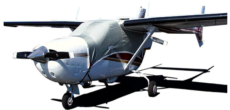
Cessna Skymaster Canopy Cover w/ 14" bib ext.