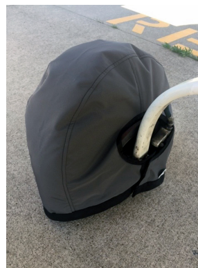
Cessna 337 Skymaster (O-2, O-2A) Tire Covers