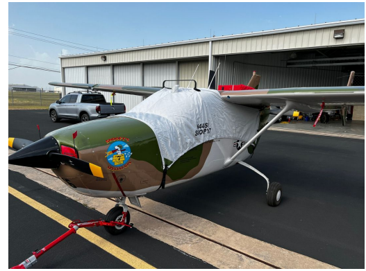
Cessna 337 Skymaster Canopy Cover with 14" bib ext., Engine Plugs