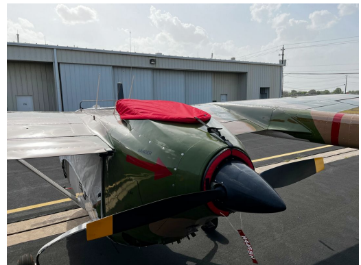
Cessna 337 Skymaster Aft Engine Inlet Cover & Plugs