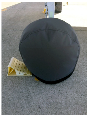
Cessna 337 Skymaster (O-2, O-2A) Tire Covers

ALL-YEAR USE MATERIAL - Made with Silver Acrylic Sunbrella canvas, the all-year use material is the best option for sun protection and cover longevity. This heavier more durable material is intended for all weather conditions, such as rain and snow or lots of sun.