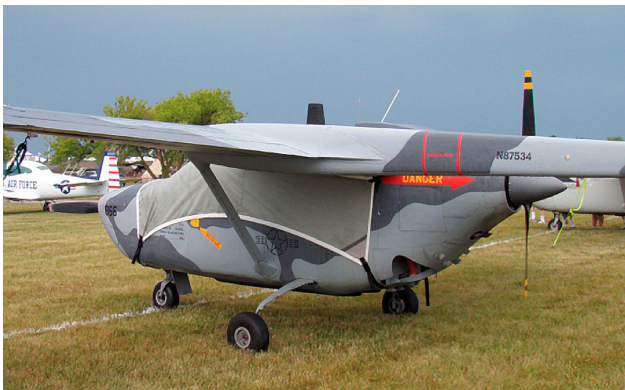
Cessna 337 Skymaster Canopy Cover w/ 14" bib ext.

This cover type is made from Silver Acrylic Sunbrella canvas and is 100% lined with a soft and smooth microfiber. Bruce's Custom Covers developed this material combination especially for aircraft protection. The outer material is medium weight and treated for water resistance, UV resistance and anti-static buildup. The inner lining is a very soft and smooth microfiber to prevent scratching. The material is very reflective, and tests show that the cabin interior temperature can be reduced to near-ambient temperature on the hottest of days. It is water, ice and snow repellent, yet breathable to allow moisture to escape from between the cover and the aircraft surface.