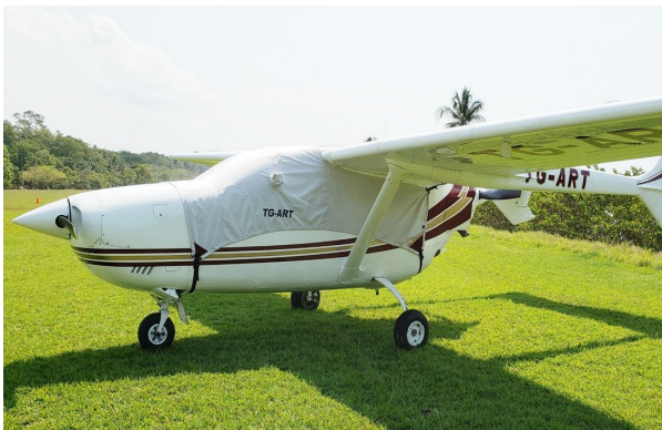
Cessna 337 Skymaster Canopy Cover w/14" Bib Extension

This cover type is made from Silver Acrylic Sunbrella canvas and is 100% lined with a soft and smooth microfiber. Bruce's Custom Covers developed this material combination especially for aircraft protection. The outer material is medium weight and treated for water resistance, UV resistance and anti-static buildup. The inner lining is a very soft and smooth microfiber to prevent scratching. The material is very reflective, and tests show that the cabin interior temperature can be reduced to near-ambient temperature on the hottest of days. It is water, ice and snow repellent, yet breathable to allow moisture to escape from between the cover and the aircraft surface.