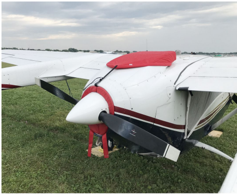
Cessna 337 Skymaster Aft Engine Inlet Cover, Rear Engine Plugs (SOLD SEPARATELY)