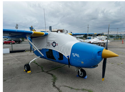
Cessna 337 Skymaster Canopy Cover with Forward "Bib"