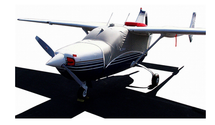
Cessna Skymaster Canopy Cover with Forward Extension