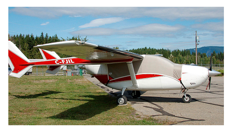
Cessna 337 Skymaster Canopy Cover w/ 14" bib ext.

This cover type is made from Silver Acrylic Sunbrella canvas and is 100% lined with a soft and smooth microfiber. Bruce's Custom Covers developed this material combination especially for aircraft protection. The outer material is medium weight and treated for water resistance, UV resistance and anti-static buildup. The inner lining is a very soft and smooth microfiber to prevent scratching. The material is very reflective, and tests show that the cabin interior temperature can be reduced to near-ambient temperature on the hottest of days. It is water, ice and snow repellent, yet breathable to allow moisture to escape from between the cover and the aircraft surface.