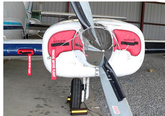
Cessna 310P Engine Inlet and Center Section Inlet Plugs