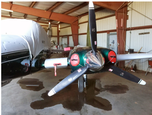
Cessna 310 Engine and Center Section Plugs

Engine Inlet Plugs are custom fit for your Cessna 320 intakes, made with heavy-duty vinyl material, and stuffed with a single block of sculpted urethane foam. Each plug has a zipper that allows the foam to be removed and dried if necessary. Engine plugs have warning flags that are visible from the cockpit or 'remove before flight' streamers sewn onto the face of the plugs. Most plugs are imprinted with the aircraft registration number in black for an extra charge. Storage bag NOT included. Engine plugs may be inserted after flight when the engine is still warm. Engine Inlet Plugs are commonly referred to as Cowl Plugs, Intake Plugs, Cowl Blocks, Engine Blocks, and Engine Bungs.