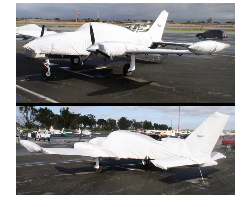
Cessna 310 Complete Cover Set