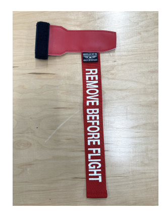
Cessna 310 Engine and Center Section Plugs