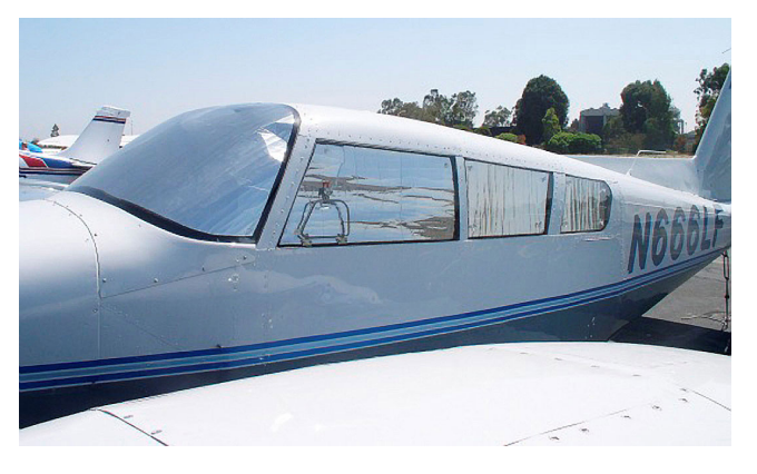
Piper PA-30 Twin Comanche Cockpit HeatShields