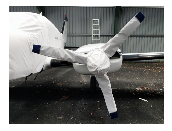
Cessna 310 Propellor/Spinner Covers, 3 Blade

This cover type is made from Silver Acrylic Sunbrella canvas and is 100% lined with a soft and smooth microfiber. Bruce's Custom Covers developed this material combination especially for aircraft protection. The outer material is medium weight and treated for water resistance, UV resistance and anti-static buildup. The inner lining is a very soft and smooth microfiber to prevent scratching. The material is very reflective, and tests show that the cabin interior temperature can be reduced to near-ambient temperature on the hottest of days. It is water, ice and snow repellent, yet breathable to allow moisture to escape from between the cover and the aircraft surface.