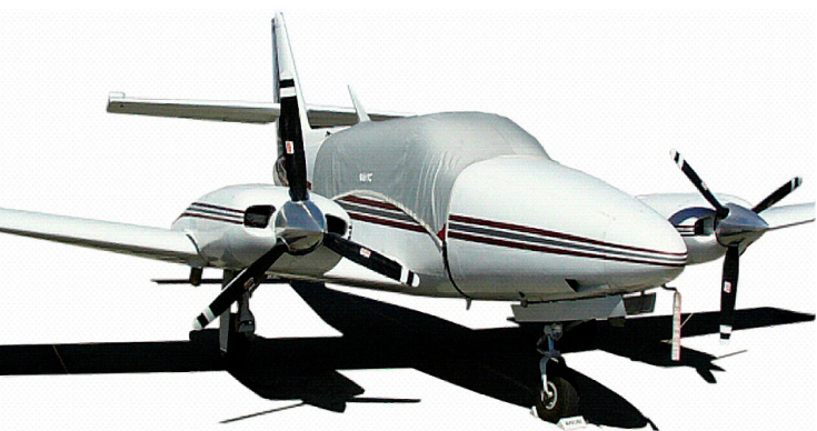
Cessna Crusader Standard Canopy Cover