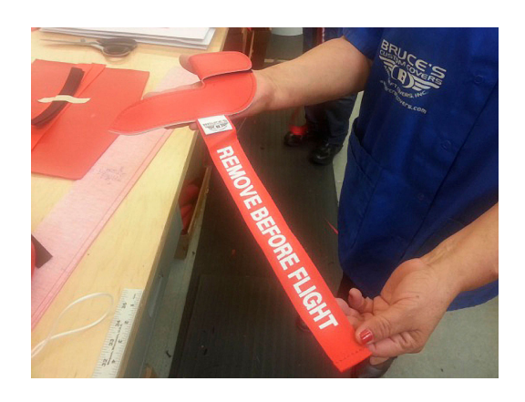
Cessna 150 Pitot Cover

Engine Inlet Plugs are custom fit for your Cessna T303 Crusader intakes, made with heavy-duty vinyl material, and stuffed with a single block of sculpted urethane foam. Each plug has a zipper that allows the foam to be removed and dried if necessary. Engine plugs have warning flags that are visible from the cockpit or 'remove before flight' streamers sewn onto the face of the plugs. Most plugs are imprinted with the aircraft registration number in black for an extra charge. Storage bag NOT included. Engine plugs may be inserted after flight when the engine is still warm. Engine Inlet Plugs are commonly referred to as Cowl Plugs, Intake Plugs, Cowl Blocks, Engine Blocks, and Engine Bungs.