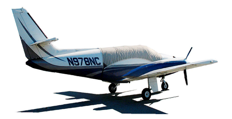
Cessna 303 Crusader Canopy Cover

This cover type is made from Silver Acrylic Sunbrella canvas and is 100% lined with a soft and smooth microfiber. Bruce's Custom Covers developed this material combination especially for aircraft protection. The outer material is medium weight and treated for water resistance, UV resistance and anti-static buildup. The inner lining is a very soft and smooth microfiber to prevent scratching. The material is very reflective, and tests show that the cabin interior temperature can be reduced to near-ambient temperature on the hottest of days. It is water, ice and snow repellent, yet breathable to allow moisture to escape from between the cover and the aircraft surface.