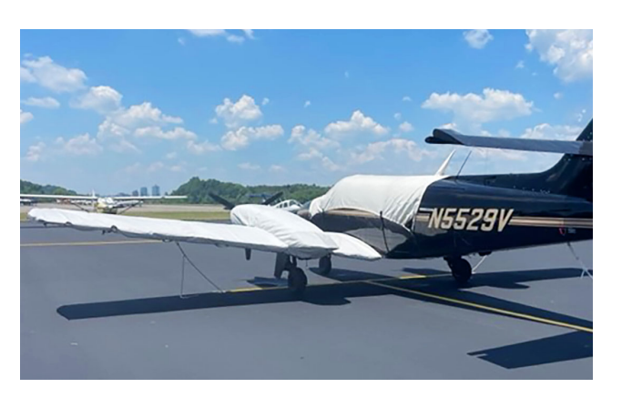
Cessna T303 Crusader Canopy Cover