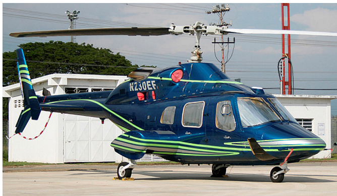
Bell 230 Engine Plugs, HeatShields

Heatshields are interior sunshades for an aircraft's windows or canopy glass. The product is a unique composite of closed-cell foam with a silver mylar finish. The semi-rigid design is stiff enough to stand along the inside of the windshield using sun visors or window framing. It folds up flat and easily stores in the included storage sleeve. Some designs may require velcro and suction cups. A Heatshield is an excellent short-term remedy for cockpit overheating.