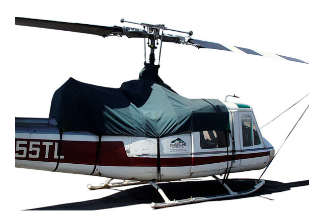
Bell 204/205 Engine/Mid-Cabin Cover