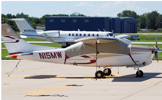
Cessna 210 Canopy Cover, Engine Plugs, Tailcone Cover

Engine Inlet Plugs are custom fit for your Cessna 210 Centurion intakes, made with heavy-duty vinyl material, and stuffed with a single block of sculpted urethane foam. Each plug has a zipper that allows the foam to be removed and dried if necessary. Engine plugs have warning flags that are visible from the cockpit or 'remove before flight' streamers sewn onto the face of the plugs. Most plugs are imprinted with the aircraft registration number in black for an extra charge. Storage bag NOT included. Engine plugs may be inserted after flight when the engine is still warm. Engine Inlet Plugs are commonly referred to as Cowl Plugs, Intake Plugs, Cowl Blocks, Engine Blocks, and Engine Bungs.