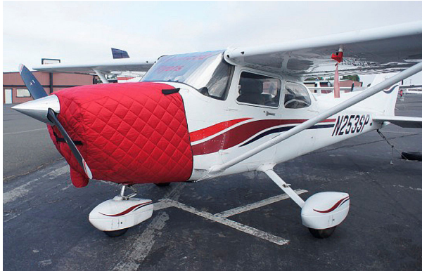
Cessna 172 Insulated Engine Cover, fully enclosed

Windshield Heatshields are interior sunshades for an aircraft's front windshield. The product is a unique composite of closed-cell foam with a silver mylar finish. The semi-rigid design is stiff enough to stand along the inside of the windshield using sun visors or window framing. It folds up flat and easily stores in the included storage sleeve. Some designs may require velcro and suction cups or split right and left sides. A Heatshield is an excellent short-term remedy for cockpit overheating. An external fabric cover is far more effective and practical for long-term protection.