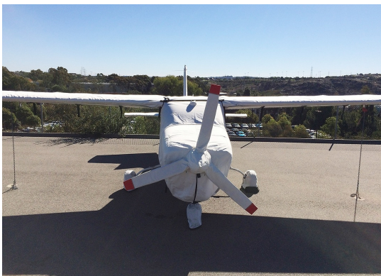
Cessna 210 Full Cover Set

This cover type is made from Silver Acrylic Sunbrella canvas and is 100% lined with a soft and smooth microfiber. Bruce's Custom Covers developed this material combination especially for aircraft protection. The outer material is medium weight and treated for water resistance, UV resistance and anti-static buildup. The inner lining is a very soft and smooth microfiber to prevent scratching. The material is very reflective, and tests show that the cabin interior temperature can be reduced to near-ambient temperature on the hottest of days. It is water, ice and snow repellent, yet breathable to allow moisture to escape from between the cover and the aircraft surface.