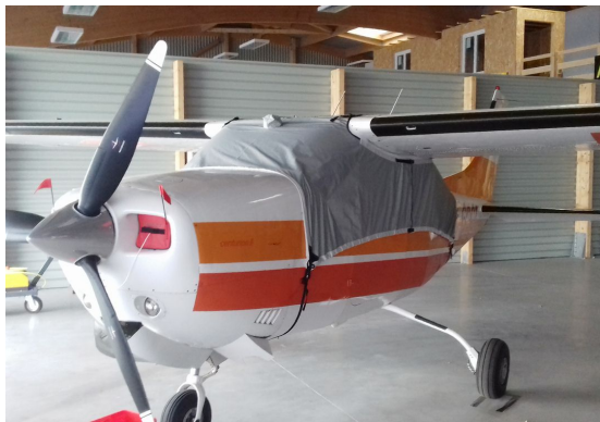
Cessna 210N Engine Inlet Plugs

Travel Covers are made with Silver Solution-Dyed Polyester fabric and only lined over the windshield to save weight. The material is lightweight and more compact for easy stowage in the aircraft. The polyester material is water resistant, but only intended for occasional use outside. We also have an ultra lightweight material available for fitted hangar dust covers. For daily outdoor use, the non-travel Sunbrella Cover is the best choice.