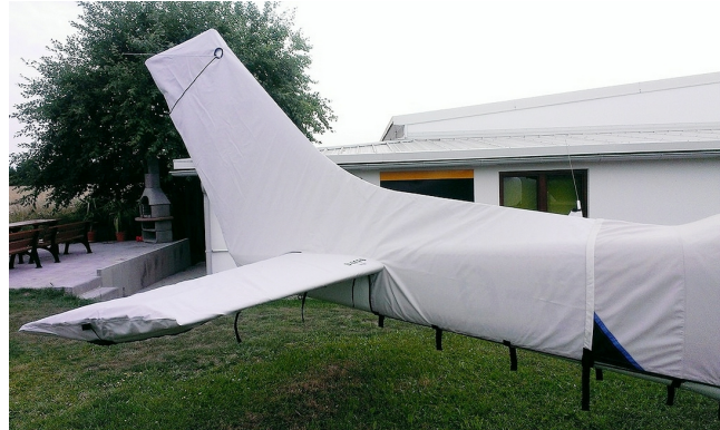
Cessna 210 Empennage Cover