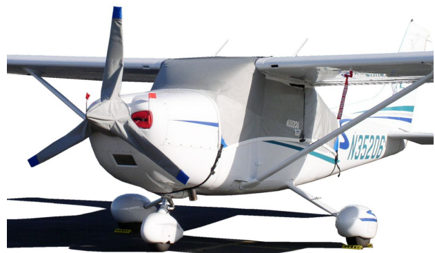
Cessna 182 Canopy Cover, Engine Plugs, 3-Blade Prop Cover