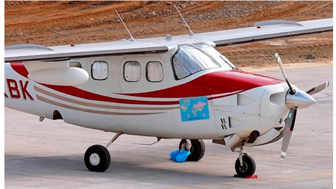
Cessna P210 HeatShield Set