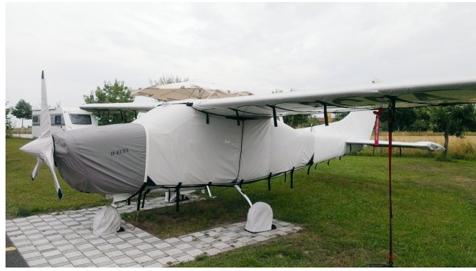
Cessna 210 Complete Cover Set