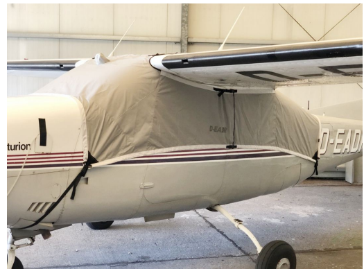
Cessna 210 Travel Weight Canopy Cover