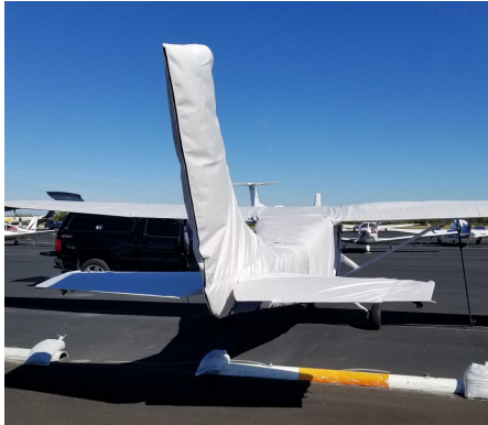
Cessna 210B Empennage Cover

WINTER USE MATERIAL - Made with Solution-Dyed Polyester fabric, this option is intended for seasonal use to aid in deicing, rain mitigation, or for occasional travel. The material is lighter and more compact, but more susceptible to UV damage and may have a shorter useful life if used continuously outside than the all-year use material.