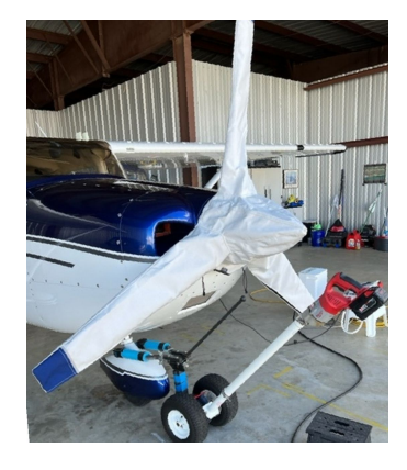
Cessna 182 Skylane 3-Blade Prop Cover