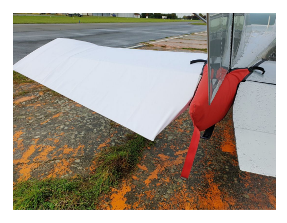
Cessna 207 Tailcone Cover, Horizontal Stab. Cover (test fit)