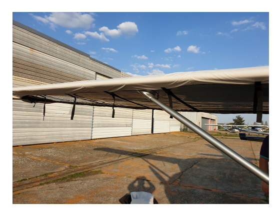
Cessna 207 Wing Covers

WINTER USE MATERIAL - Made with Solution-Dyed Polyester fabric, this option is intended for seasonal use to aid in deicing, rain mitigation, or for occasional travel. The material is lighter and more compact, but more susceptible to UV damage and may have a shorter useful life if used continuously outside than the all-year use material.