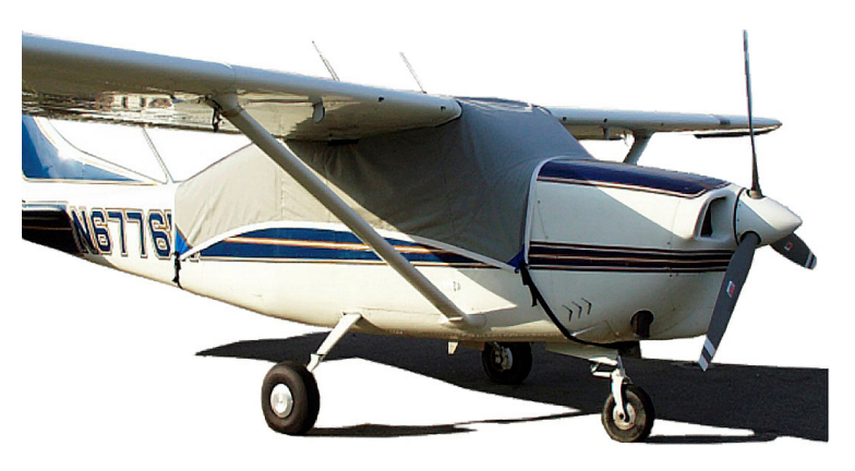
Cessna 206 Canopy Cover