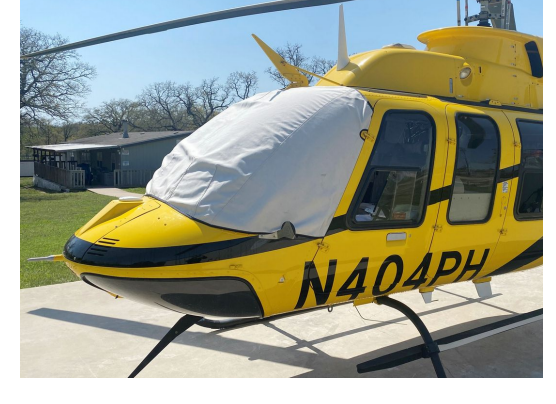
JetRanger Bubble Cover