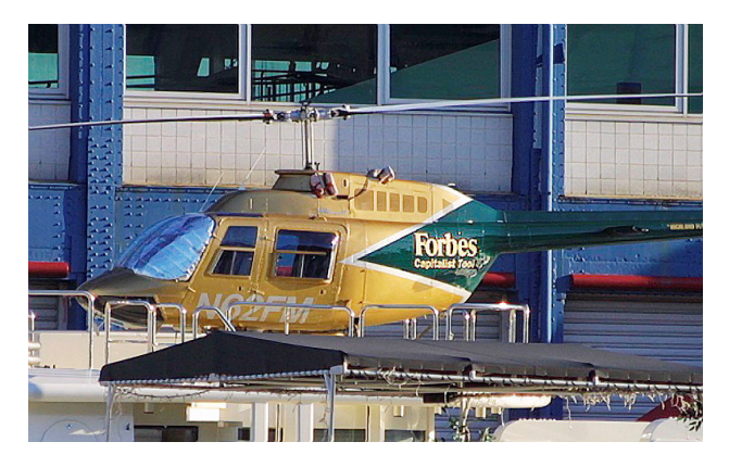
Bell 206B Jetranger Windshield HeatShields

Heatshields are interior sunshades for an aircraft's windows or canopy glass. The product is a unique composite of closed-cell foam with a silver mylar finish. The semi-rigid design is stiff enough to stand along the inside of the windshield using sun visors or window framing. It folds up flat and easily stores in the included storage sleeve. Some designs may require velcro and suction cups. A Heatshield is an excellent short-term remedy for cockpit overheating.