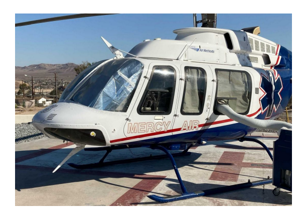
Bell 407 Windshield HeatShields