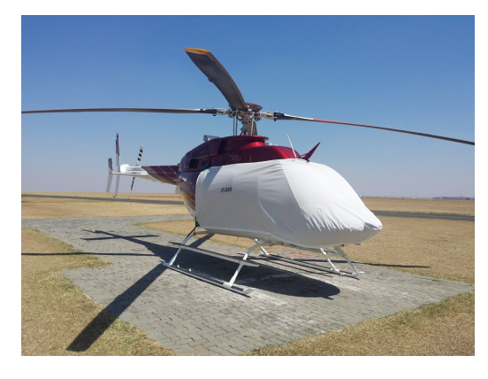
Bell 407 Bubble Cover with Wire Strike

Travel Covers are made with Silver Solution-Dyed Polyester fabric and fully lined over the entire cover. The material is lightweight and more compact for easy stowage in the aircraft. The polyester material is water resistant, but only intended for occasional use outside. We also have an ultra lightweight material available for fitted hangar dust covers. For daily outdoor use, the non-travel Sunbrella Cover is the best choice.