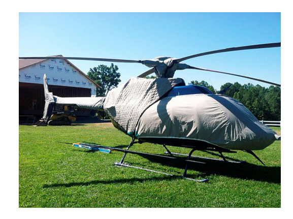
Bell 407 Covers: Bubble, Insulated Engine, Rotor Mast, Blades, Tailboom, Vertical Stabilizer and Tail Rotor