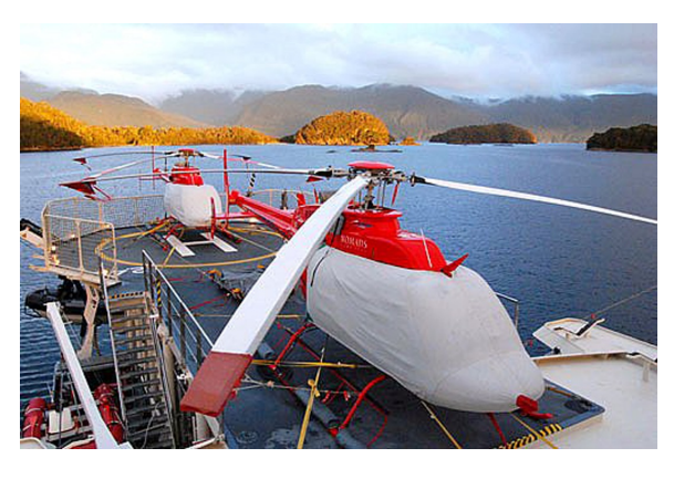
Bell 407 Bubble Cover