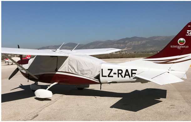
Cessna 206 Stationair Canopy Cover, Over-Top Style