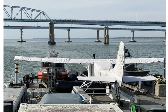
Cessna U206F Amphib Cover Set