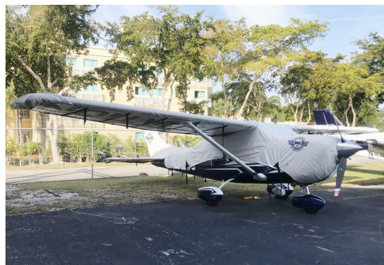
Cessna T206H Canopy, Engine, Wing & Empennage Covers