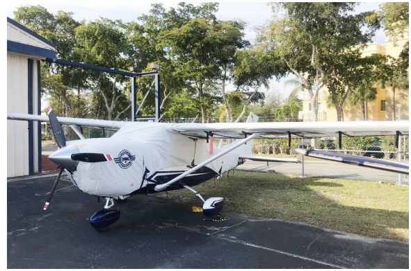
Cessna T206H Canopy, Engine, Wing & Empennage Covers