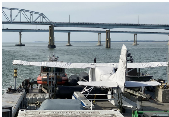
Cessna U206F Amphib Cover Set

WINTER USE MATERIAL - Made with Solution-Dyed Polyester fabric, this option is intended for seasonal use to aid in deicing, rain mitigation, or for occasional travel. The material is lighter and more compact, but more susceptible to UV damage and may have a shorter useful life if used continuously outside than the all-year use material.