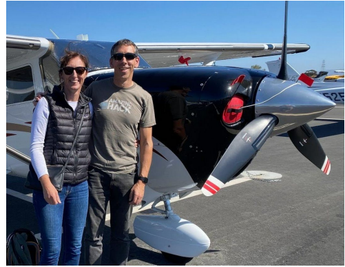
Cessna 206 Engine Inlet Plugs