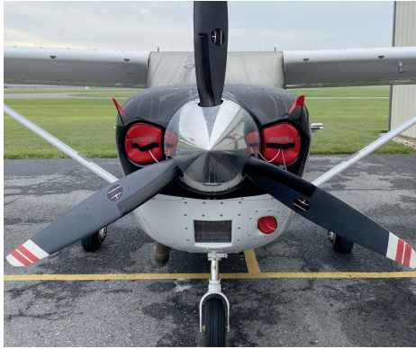
Cessna 206 Engine Inlet Plugs