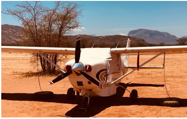
Cessna 206 Canopy Cover