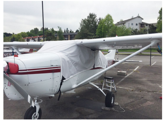
Cessna 205 Over-Top Canopy Cover