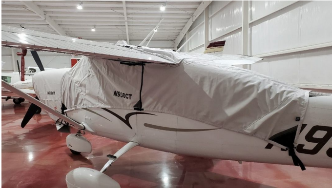
Cessna T206H Over-Top Canopy Cover, Engine Cover

This cover type is made from Silver Acrylic Sunbrella canvas and is 100% lined with a soft and smooth microfiber. Bruce's Custom Covers developed this material combination especially for aircraft protection. The outer material is medium weight and treated for water resistance, UV resistance and anti-static buildup. The inner lining is a very soft and smooth microfiber to prevent scratching. The material is very reflective, and tests show that the cabin interior temperature can be reduced to near-ambient temperature on the hottest of days. It is water, ice and snow repellent, yet breathable to allow moisture to escape from between the cover and the aircraft surface.