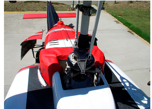
Bell 204 Particle Separator (intake) Cover