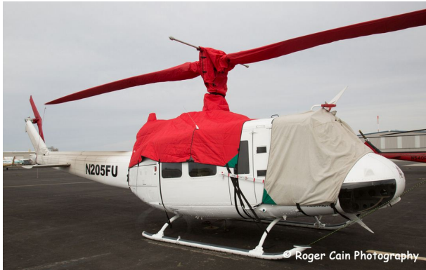
Bell 205 Engine, Rotor Mast, Blades & Forward Cabin Covers

WINTER USE MATERIAL - Made with Solution-Dyed Polyester fabric, this option is intended for seasonal use to aid in deicing, rain mitigation, or for occasional travel. The material is lighter and more compact, but more susceptible to UV damage and may have a shorter useful life if used continuously outside than the all-year use material.