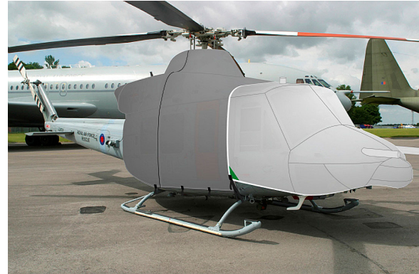
Forward Cabin Nose & Mid-Cabin/Engine Cover (extended to cross tubes)