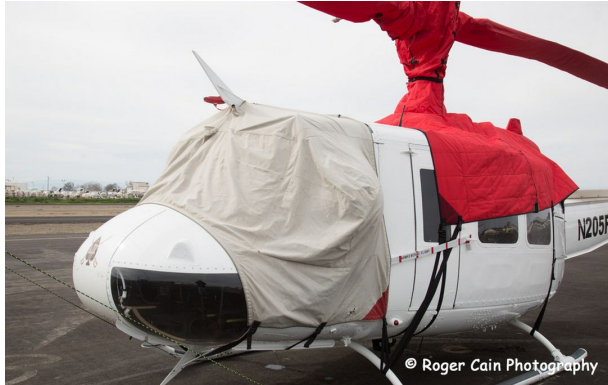
Bell 205 Engine, Rotor Mast, Blades & Forward Cabin Covers

This cover type is made from Silver Acrylic Sunbrella canvas and is 100% lined with a soft and smooth microfiber. Bruce's Custom Covers developed this material combination especially for aircraft protection. The outer material is medium weight and treated for water resistance, UV resistance and anti-static buildup. The inner lining is a very soft and smooth microfiber to prevent scratching. The material is very reflective, and tests show that the cabin interior temperature can be reduced to near-ambient temperature on the hottest of days. It is water, ice and snow repellent, yet breathable to allow moisture to escape from between the cover and the aircraft surface.