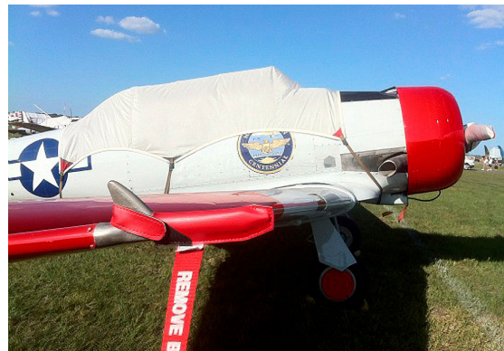
T6 Pitot, Canopy & Prop Covers