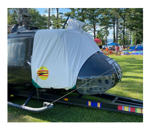
Bell 204 Forward Cabin Cover