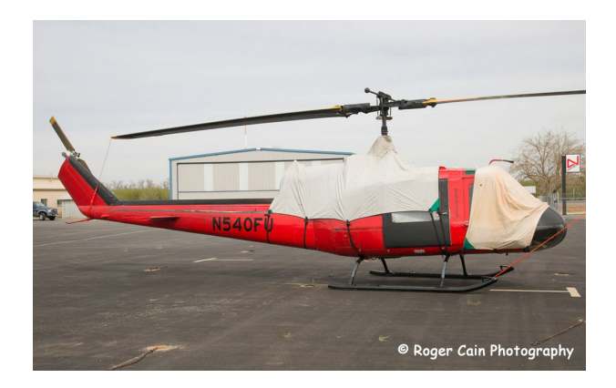
Bell 204 Engine and Cockpit Covers

WINTER USE MATERIAL - Made with Solution-Dyed Polyester fabric, this option is intended for seasonal use to aid in deicing, rain mitigation, or for occasional travel. The material is lighter and more compact, but more susceptible to UV damage and may have a shorter useful life if used continuously outside than the all-year use material.