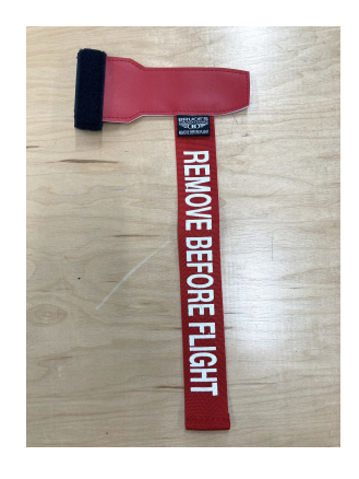
Pitot Tube Cover

Bell 204 & UH-1 Huey Pitot Tube Covers , NOT HEAT RESISTANT TYPE, are made of Naugahyde vinyl, and are designed to cover the entire pitot assembly. Slipping over the tube, the cover tightens around the base with a Velcro strap detail. A "Remove Before Flight" streamer is attached to the cover. Heat Resistant Pitot Covers are an upgrade to this design, and help prevent the pitot cover from melting onto the tube if the pitot heat is accidentally turned on while installed. If you want the set tethered together, please let us know.