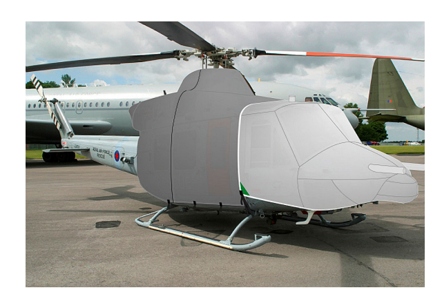
Forward Cabin Nose & Mid-Cabin/Engine Cover (extended to cross tubes)

This cover type is made from Silver Acrylic Sunbrella canvas and is 100% lined with a soft and smooth microfiber. Bruce's Custom Covers developed this material combination especially for aircraft protection. The outer material is medium weight and treated for water resistance, UV resistance and anti-static buildup. The inner lining is a very soft and smooth microfiber to prevent scratching. The material is very reflective, and tests show that the cabin interior temperature can be reduced to near-ambient temperature on the hottest of days. It is water, ice and snow repellent, yet breathable to allow moisture to escape from between the cover and the aircraft surface.