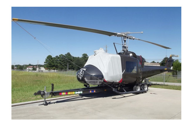
Bell 204 UH-1 Cockpit Cover