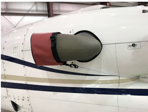
Beech King Air 350 Exhaust Covers

This cover type is made from Silver Acrylic Sunbrella canvas and is 100% lined with a soft and smooth microfiber. Bruce's Custom Covers developed this material combination especially for aircraft protection. The outer material is medium weight and treated for water resistance, UV resistance and anti-static buildup. The inner lining is a very soft and smooth microfiber to prevent scratching. The material is very reflective, and tests show that the cabin interior temperature can be reduced to near-ambient temperature on the hottest of days. It is water, ice and snow repellent, yet breathable to allow moisture to escape from between the cover and the aircraft surface.