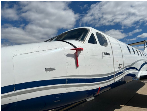
Beech 1900C PITOT COVERS

Engine Inlet Plugs are custom fit for your Beech 1900C intakes, made with heavy-duty vinyl material, and stuffed with a single block of sculpted urethane foam. Each plug has a zipper that allows the foam to be removed and dried if necessary. Engine plugs have warning flags that are visible from the cockpit or 'remove before flight' streamers sewn onto the face of the plugs. Most plugs are imprinted with the aircraft registration number in black for an extra charge. Storage bag NOT included. Engine plugs may be inserted after flight when the engine is still warm. Engine Inlet Plugs are commonly referred to as Cowl Plugs, Intake Plugs, Cowl Blocks, Engine Blocks, and Engine Bungs.