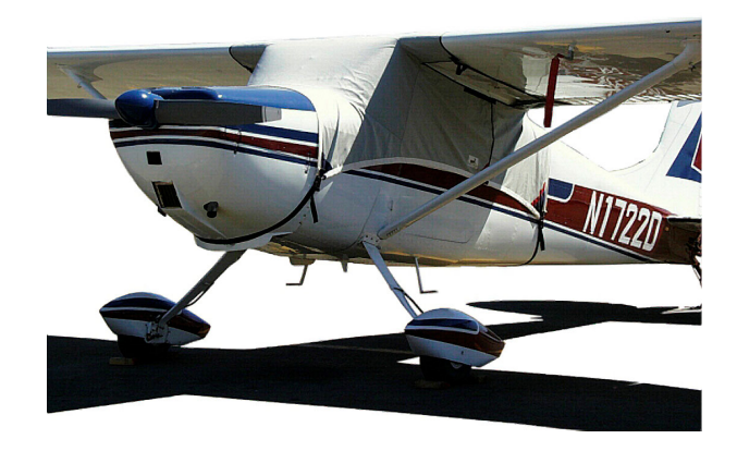
Over-the-Top Canopy Cover