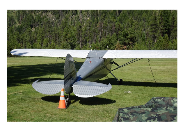
Cessna 170 Wing Covers