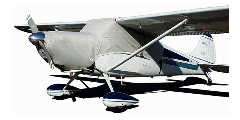
Cessna 170 Canopy Cover & Engine Cover