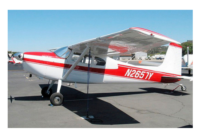
Cessna 180 & 185 Windshield HeatShield