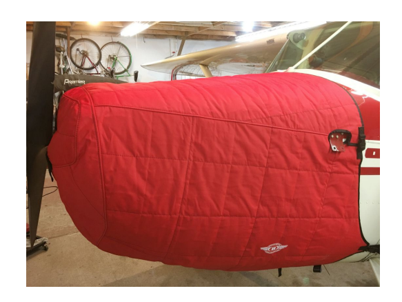
Cessna 170 Insulated Engine Cover

This cover type is made from Silver Acrylic Sunbrella canvas and is 100% lined with a soft and smooth microfiber. Bruce's Custom Covers developed this material combination especially for aircraft protection. The outer material is medium weight and treated for water resistance, UV resistance and anti-static buildup. The inner lining is a very soft and smooth microfiber to prevent scratching. The material is very reflective, and tests show that the cabin interior temperature can be reduced to near-ambient temperature on the hottest of days. It is water, ice and snow repellent, yet breathable to allow moisture to escape from between the cover and the aircraft surface.