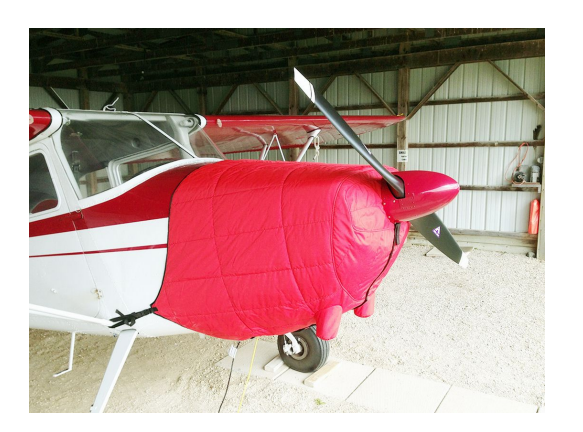
Cessna 170 Insulated Engine Cover