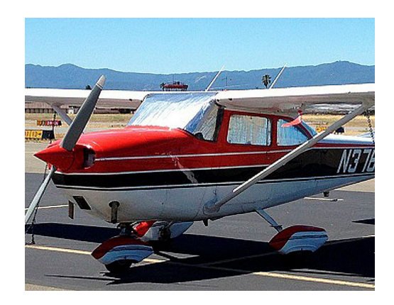
Cessna 172 Cabin HeatShields

Windshield Heatshields are interior sunshades for an aircraft's front windshield. The product is a unique composite of closed-cell foam with a silver mylar finish. The semi-rigid design is stiff enough to stand along the inside of the windshield using sun visors or window framing. It folds up flat and easily stores in the included storage sleeve. Some designs may require velcro and suction cups or split right and left sides. A Heatshield is an excellent short-term remedy for cockpit overheating. An external fabric cover is far more effective and practical for long-term protection.