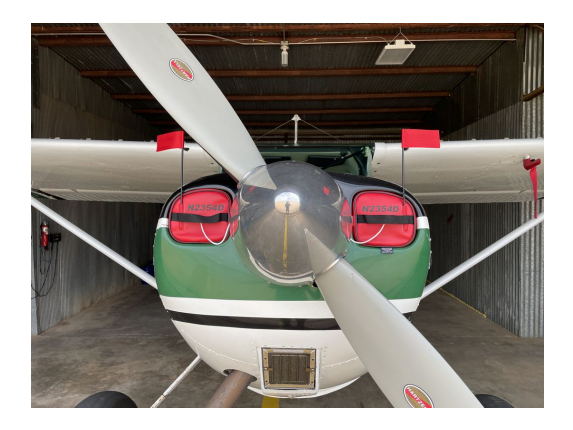
Cessna 170B Engine Inlet Plugs (B Model) Includes Carb Inlet Plug