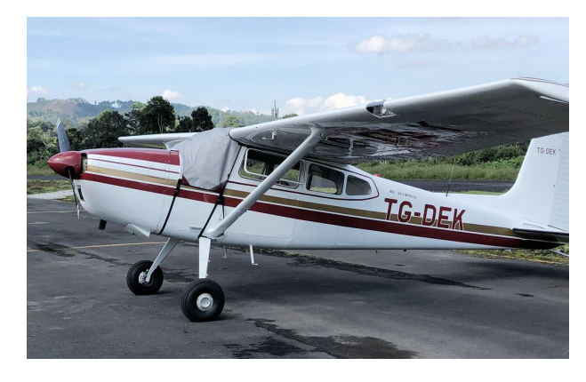
Cessna 180 Windshield Cover

This cover type is made from Silver Acrylic Sunbrella canvas and is 100% lined with a soft and smooth microfiber. Bruce's Custom Covers developed this material combination especially for aircraft protection. The outer material is medium weight and treated for water resistance, UV resistance and anti-static buildup. The inner lining is a very soft and smooth microfiber to prevent scratching. The material is very reflective, and tests show that the cabin interior temperature can be reduced to near-ambient temperature on the hottest of days. It is water, ice and snow repellent, yet breathable to allow moisture to escape from between the cover and the aircraft surface.