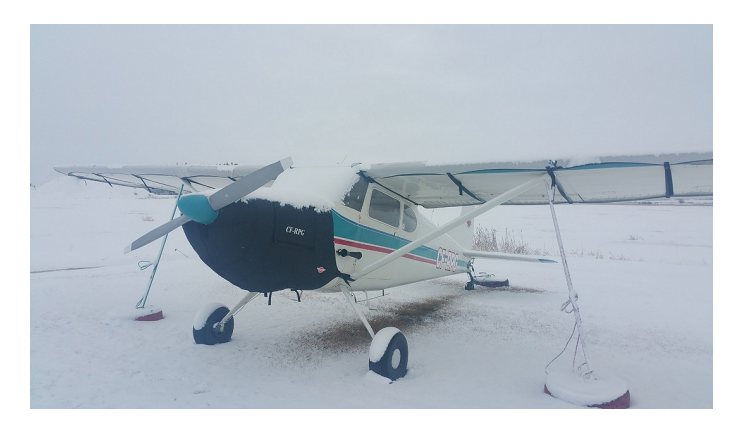
Cessna 170 Insulated Engine Cover, Wing Covers

WINTER USE MATERIAL - Made with Solution-Dyed Polyester fabric, this option is intended for seasonal use to aid in deicing, rain mitigation, or for occasional travel. The material is lighter and more compact, but more susceptible to UV damage and may have a shorter useful life if used continuously outside than the all-year use material.