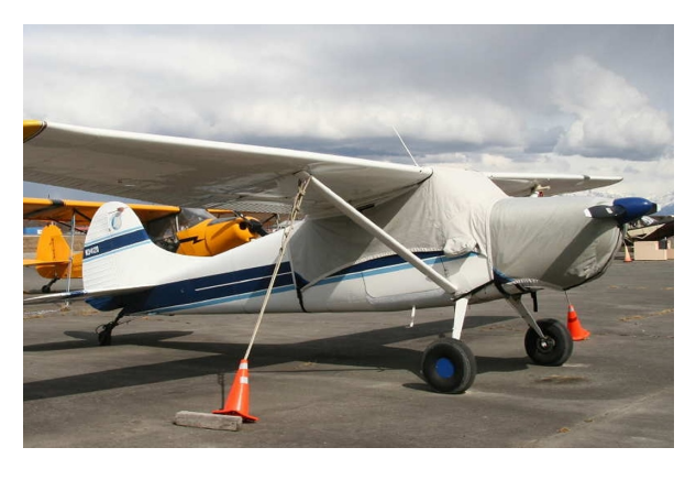
Cessna 170 Canopy Cover & Engine Cover