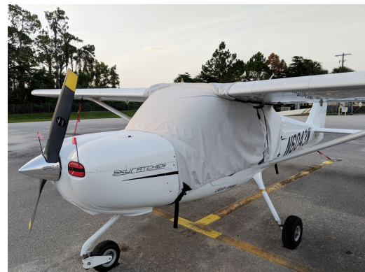
Cessna Skycatcher Prop/Spinner Cover, Engine Plugs