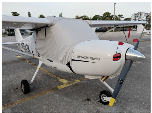
Cessna Skycatcher 162 Canopy Cover and Engine Inlet Plugs