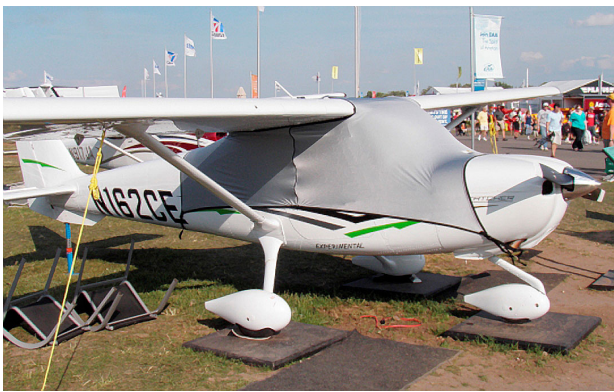
Cessna Skycatcher Spandex FlyAway Travel Cover